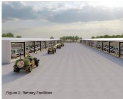
Figure 2: Battery Facilities

A new equipment storage and warehousing facility.