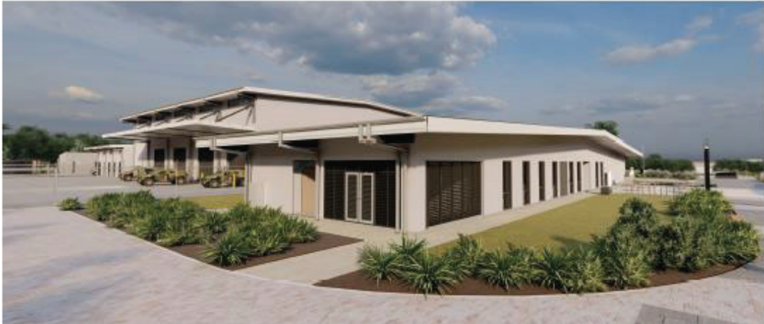
Draft concept only – subject to change