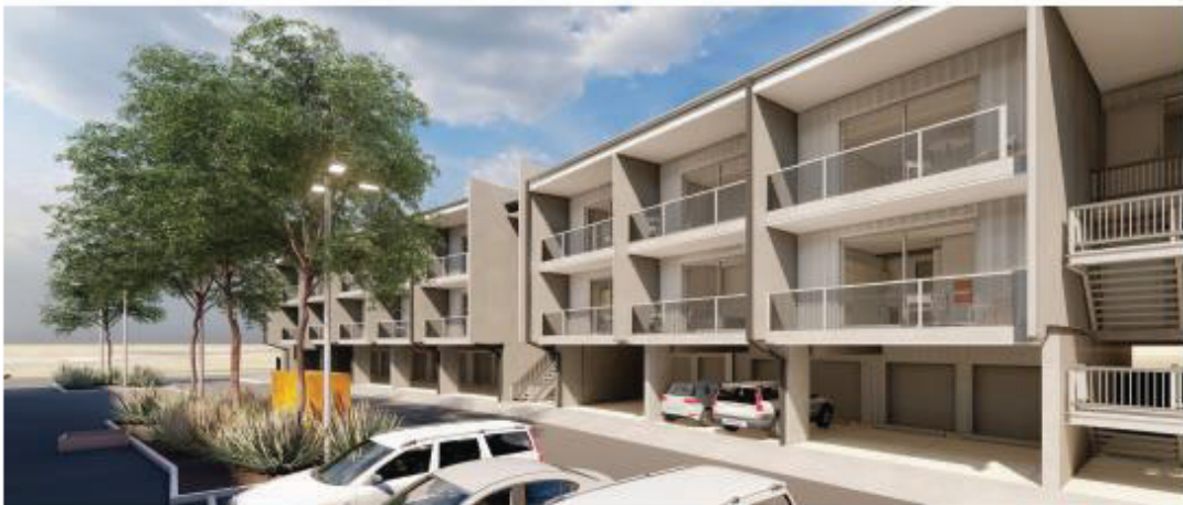
Draft concept only – subject to change