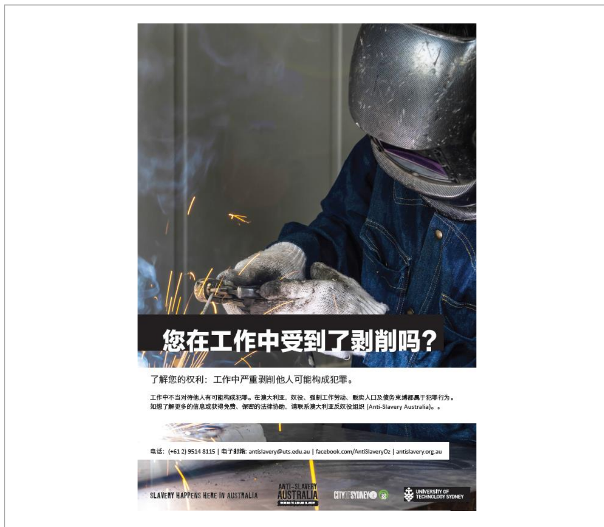
Figure 1: “Being exploited at work?” flyer produced in Simplified Chinese.

Anti-Slavery Australia has produced a number of multi-lingual resources related to exploitative practices including forced labour and forced marriage.