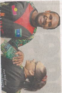
WAM HITS BACK: IWC were forced to pay $2200 and remove the Aboriginal flag from all future shirts.

"The Aboriginal flag has had licensing agreements attached to it since 1998 which have been enforced since that time. We are merely a licensee meeting our obligations under our agreements and we offer our assistance to other organisations wishing to use the flag under our licence."