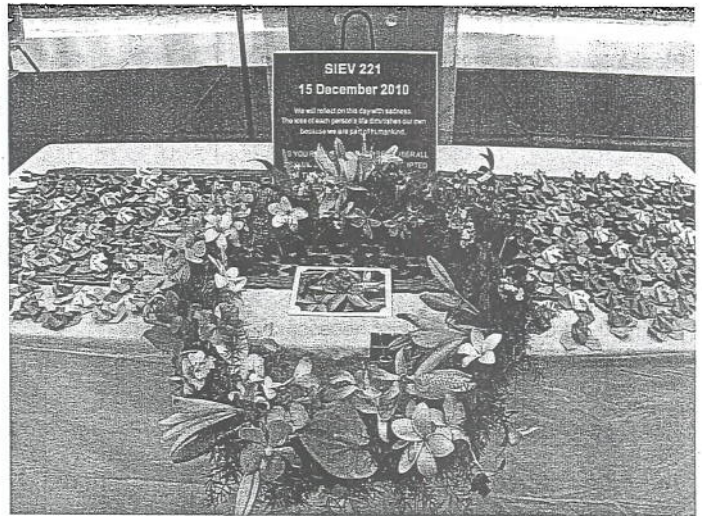
Above: plaque and flower presentation at memorial service