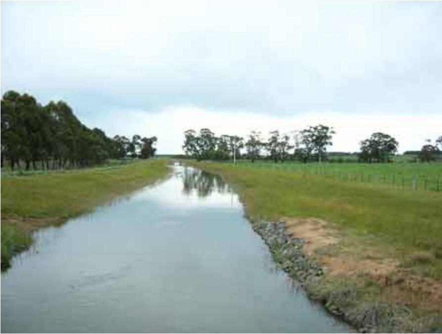
Wurdee Boluc Aquaduct south west of Geelong.