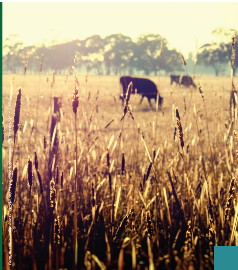
Farm, Australia. iStock Photography. https://greatdivercommons.org/licenses/by-nc-nd/2.0