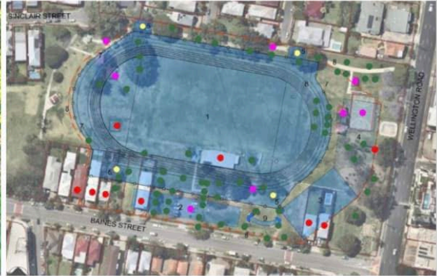
Campaign group graphic showing how the track would look in the park.

Athletics regulations mandate track measurements should be a minimum 167m long x 85m wide and have no fewer than six lanes. It would feature facilities for a