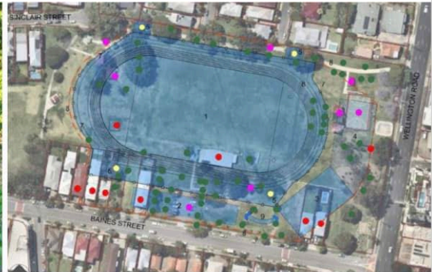
Campaign group graphic showing how the track would look in the park.

Athletics regulations mandate track measurements should be a minimum 167m long x 85m wide and have no fewer than six lanes. It would feature facilities for a