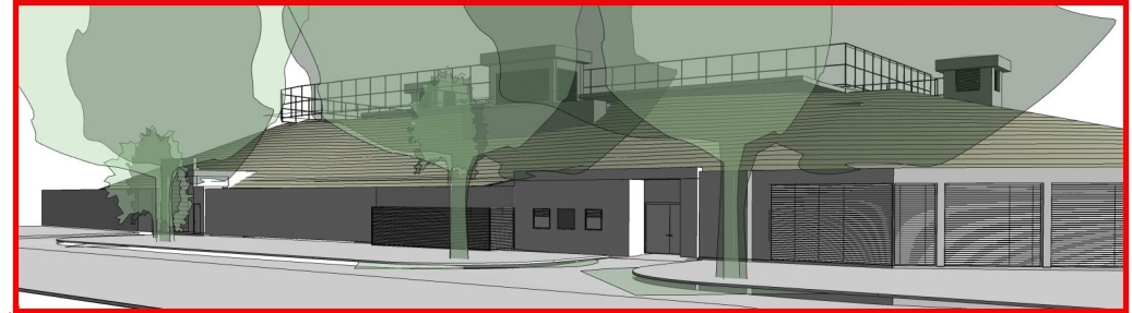
PERSPECTIVE OF BUILDING 59 LOOKING EAST