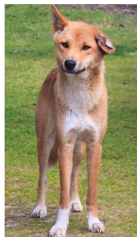
Inky with infected ear oct/nov.2012

Inky was shot but escaped with a bullet wound in his neck and an infected ear.