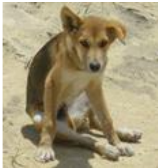
Under aged ear tagged pup at Eurong Nov. 2012

The puppy now, from his inability to hunt from this negligent, underage ear tagging, will seek food from tourists, or bear a risk of starvation, obtaining a bad mark against him for the "crime" of "Habituating" from the rangers and caused by these very QPWS rangers who tagged him.