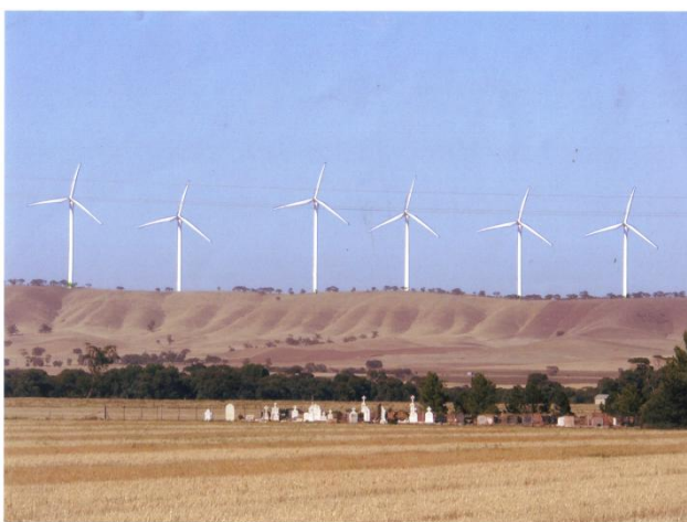
Robertstown Hills, cemetery in foreground: Is this what you want for a view?