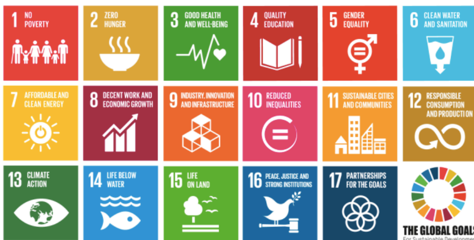
Figure 1: Sustainable Development Goals

The 17 SDGs (see figure 1) are a significantly more ambitious project. They aim to eradicate, not just reduce, extreme poverty and hunger. They also target areas that demonstrably compound poverty, by aiming to reduce inequality, tackle climate change, and realise gender equality and women's human rights.