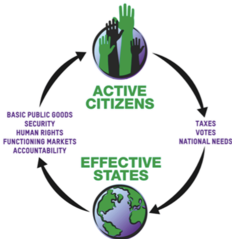
Figure 2: The citizen-state compact

Australian aid should enable countries to be owners of the development process and support the citizen-state compact by actively supporting participation, inclusive decision-making and social accountability.