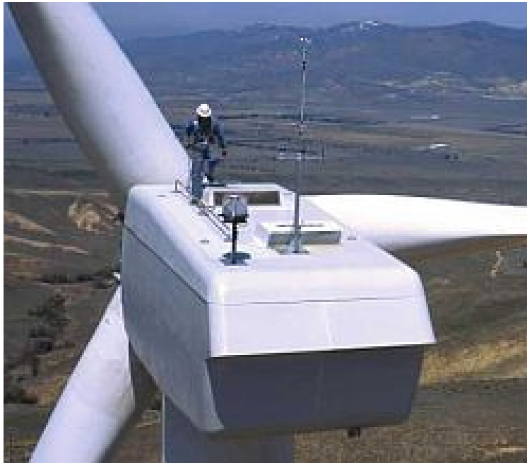
Not just a Friendly Farm Windmill.

Wind towers are a danger to workmen forced to work on small platforms at great heights sometimes in high winds.