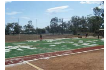
Laying the top dressing of the oval