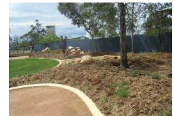
Newly landscaped playground

www.parra.catholic.edu.au/projectgenesis