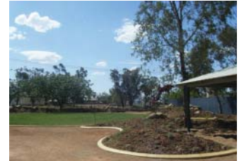
Shaded areas have been provided

The Parramatta diocese is proud to assist the Wilcannia-Forbes diocese in the development and management of their building projects.