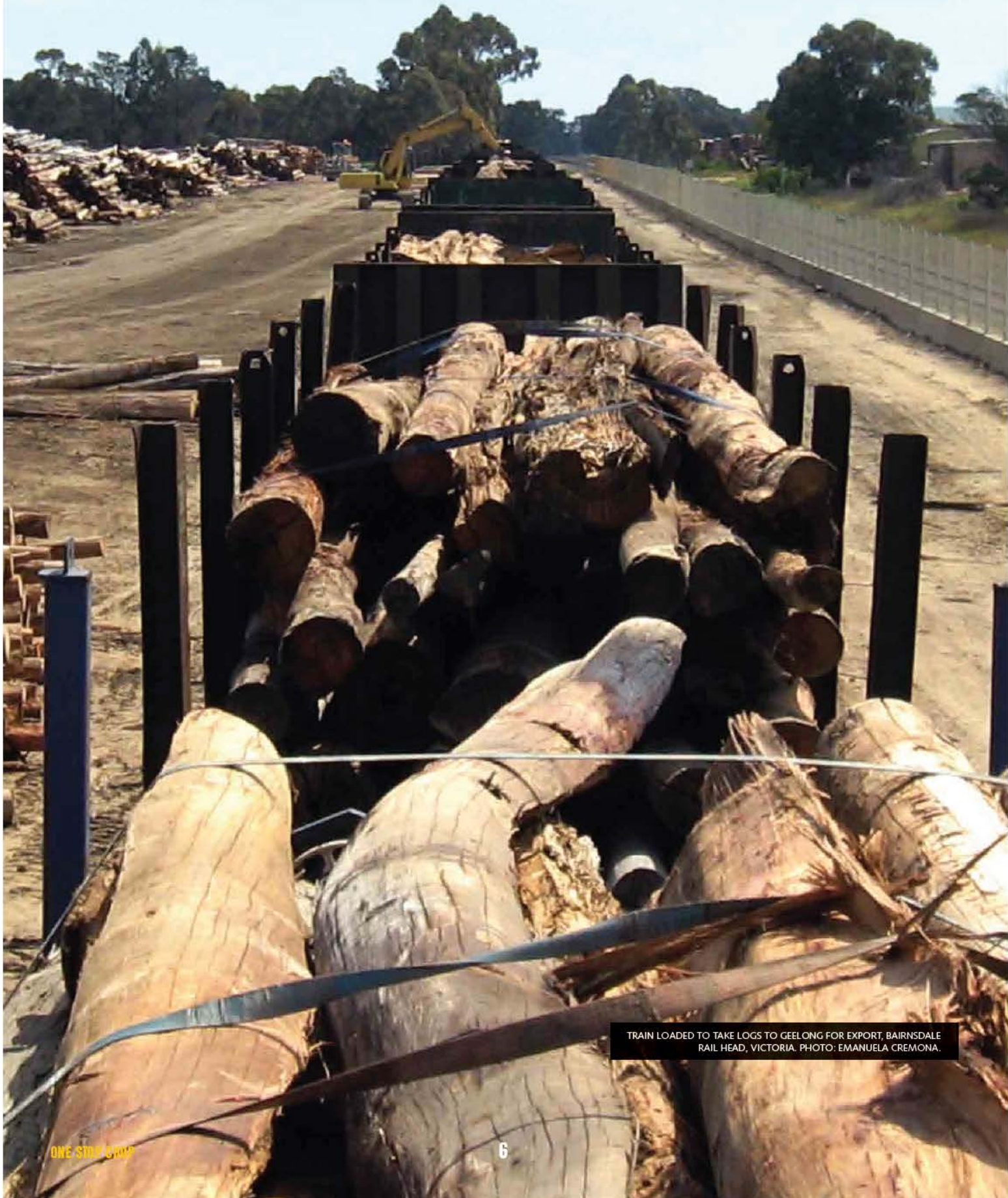
TRAIN LOADED TO TAKE LOGS TO GEELONG FOR EXPORT, BAIRNSDALE RAIL HEAD, VICTORIA.