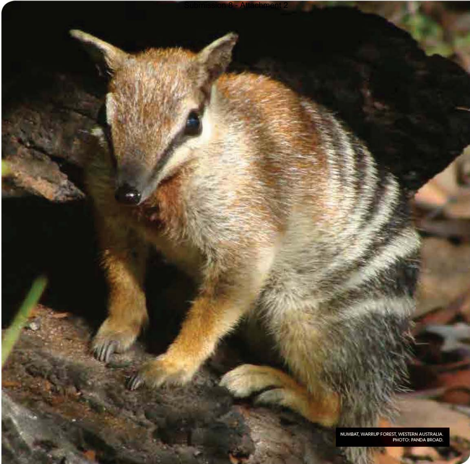
NUMBAT, WARRUP FOREST, WESTERN AUSTRALIA.

Significant procedural barriers and costs risks mean third party enforcement can only occur in limited circumstances, and be undertaken by groups with significant involvement and commitment to an issue, as well as access to significant resources. This means in circumstances where government is failing to enforce compliance with forestry laws, it is difficult for the community to pick up the slack. Nevertheless, there have been several instances when communities have taken enforcement proceedings and in doing so, have played an essential role in drawing attention to the failures of forestry agencies to comply with environment protection laws.