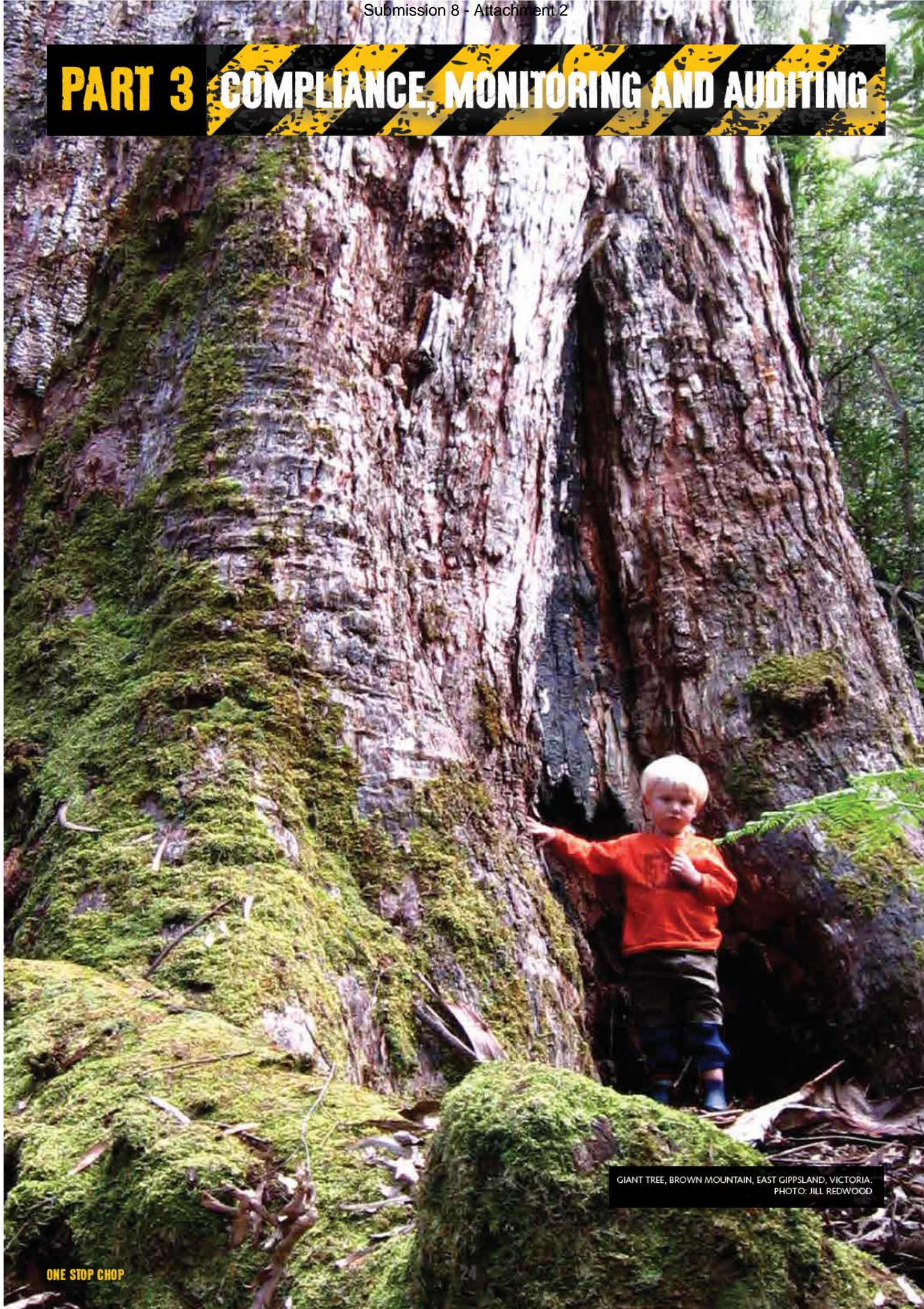
GIANT TREE, BROWN MOUNTAIN, EAST GIPPSLAND, VICTORIA.