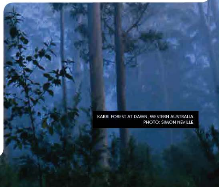
KARRI FOREST AT DAWN, WESTERN AUSTRALIA.

The fundamental question that this report seeks to address is whether the RFA regime delivers equivalent environment protection standards to those likely to be achieved if the EPBC Act applied directly to forestry operations in RFA areas. In assessing this issue, we focus primarily on biodiversity, particularly those threatened species which are matters of national environmental significance.