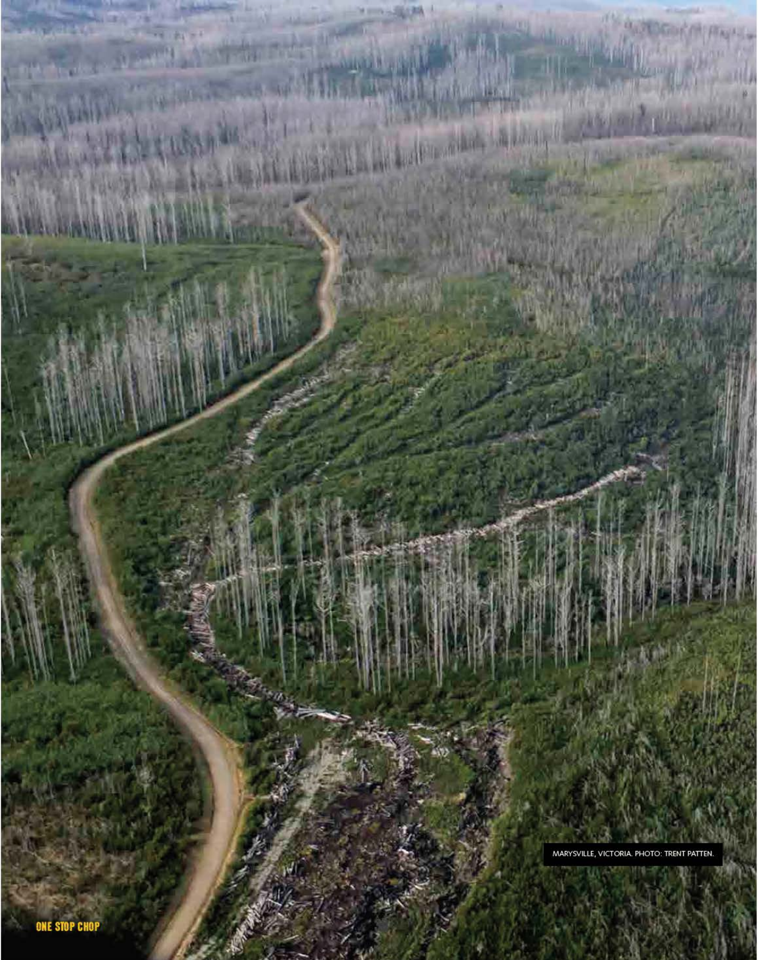
MARYSVILLE, VICTORIA.