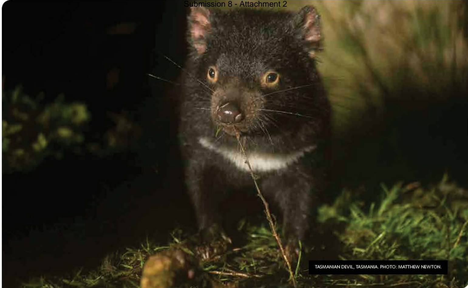
TASMANIAN DEVIL, TASMANIA.

senior zoologists in accordance with the Adviser are negotiable, if Forestry Tasmania objects.” (at [289]). He further noted (at [282]):