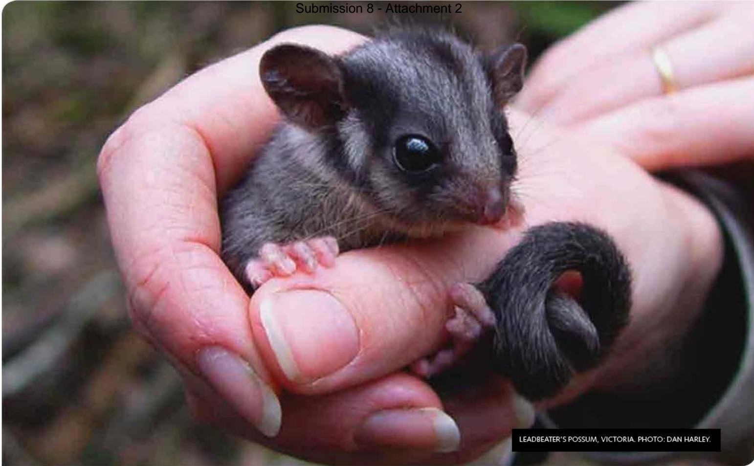
LEADBEATER'S POSSUM, VICTORIA.

are done in accordance with the approved policy, plan or program, approval of individual actions under Part 9 of the EPBC Act is not required.