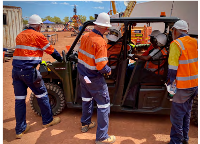
Native Title holders with Origin personnel at Kyalla during fracture stimulation (September 2020)