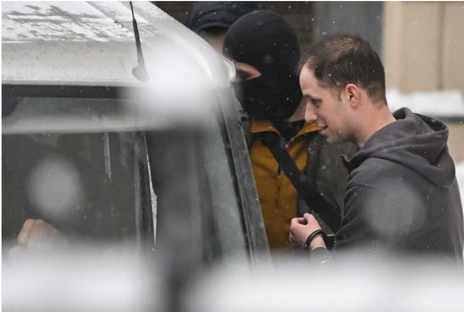
Detained U.S. journalist Evan Gershkovich, pictured in Moscow, Jan. 26, 2024

Worldwide, dozens of Australian, European, Japanese and American citizens have been arbitrarily detained in recent years, often for leverage. Scores still remain confined in heartrending conditions of humiliation, loneliness and uncertainty, all too often accompanied by human rights violations, including torture. We cannot let this stand.