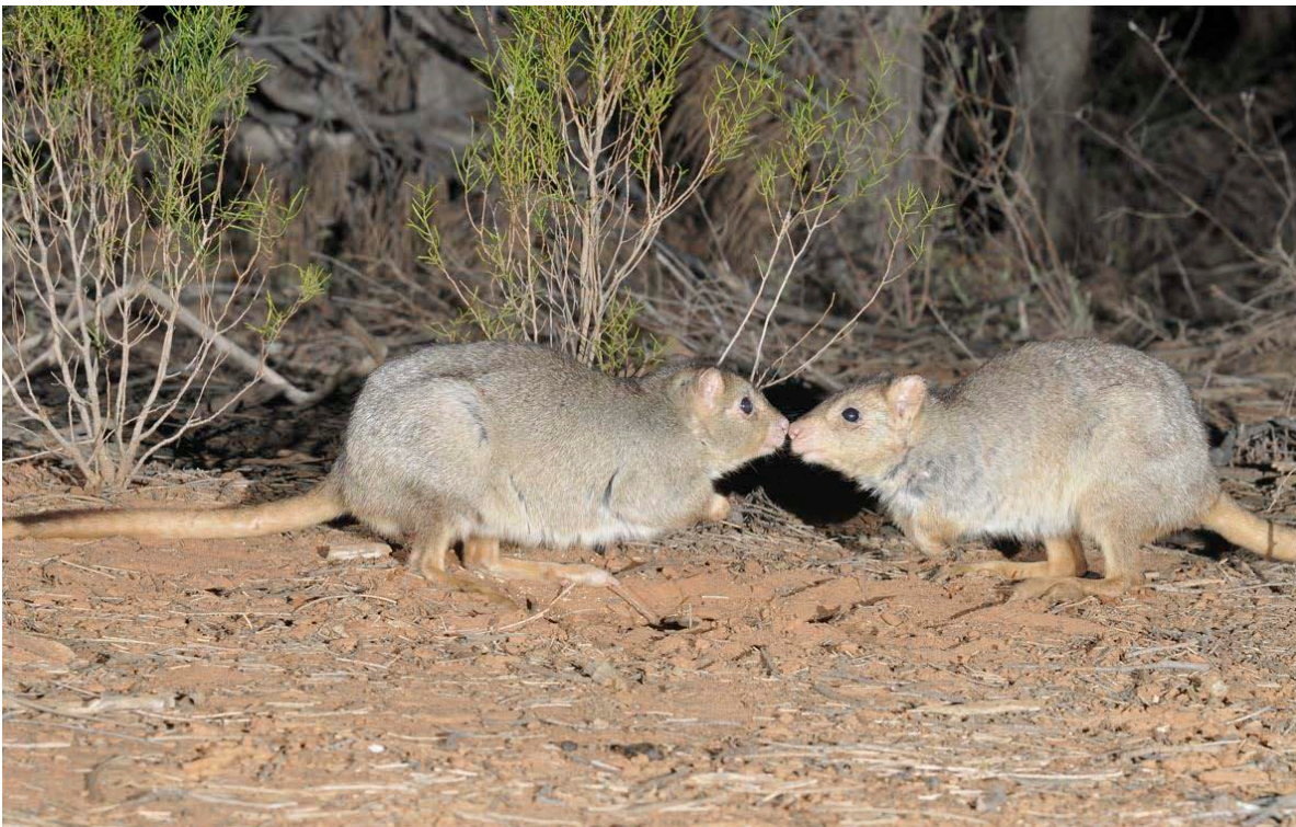
Burrowing Bettongs , AWC's Scotia Wildlife Sanctuary. This species may have once been the most common marsupial in Australia. It has been completely eradicated from the mainland by feral cats and foxes. It has been reintroduced to feral predator-free areas on AWC's Faure Island, and Scotia and Yookamurra wildlife sanctuaries.