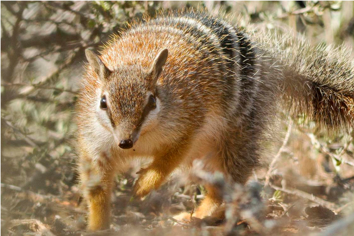
Numbat , AWC's Scotia Wildlife Sanctuary. The Numbat has contracted from much of the semi-arid region to two small populations in south-west Western Australia. AWC has reintroduced the species to feral cat-free area on Scotia, Yookamurra and Mt Gibson wildlife sanctuaries.