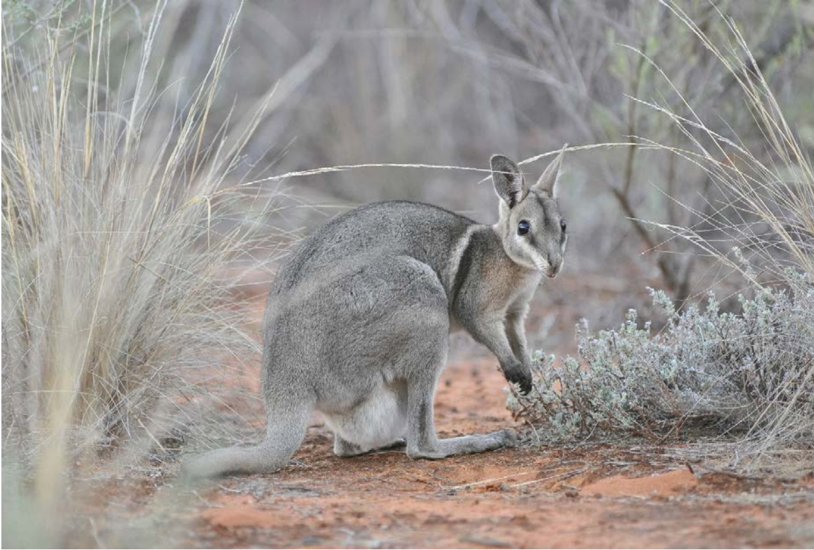
Bridled Nailtail Wallaby, AWC's Scotia Wildlife Sanctuary. This species persists in one remnant population in Qld. AWC has reintroduced the species to feral predator-free fenced areas at Scotia and Pilliga (the latter in partnership with NSW). We plan to reintroduce it to Mallee Cliffs NP (in partnership with NSW) in 2021.