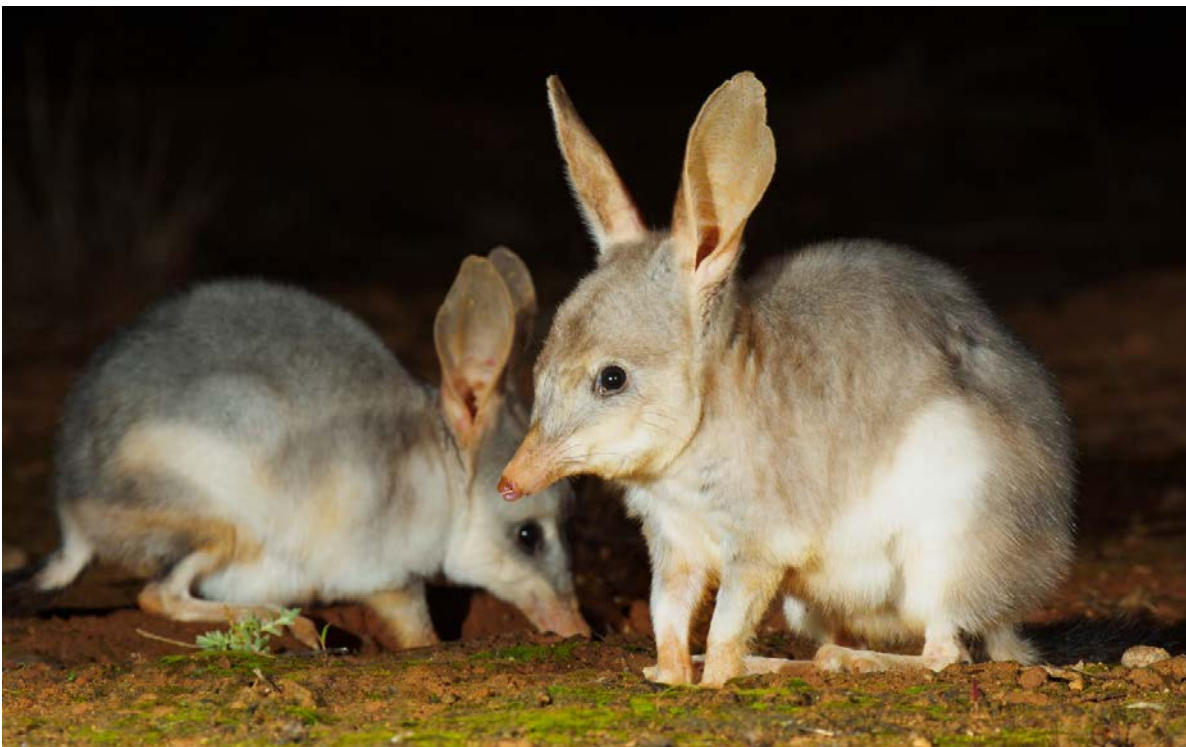
Greater Bilbies , Scotia Wildlife Sanctuary. The iconic Bilby is currently protected in five of AWC's fenced feral cat-free areas.