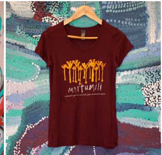
Martumili T-shirts, created through reproduction licensing agreements with Martu Artists, and available for sale through Martumili Artists.

MARTUMILI ARTISTS PMB 22 CNR Kalgan & Newman Drive Newman WA 6753 T: (08) 9175 1020