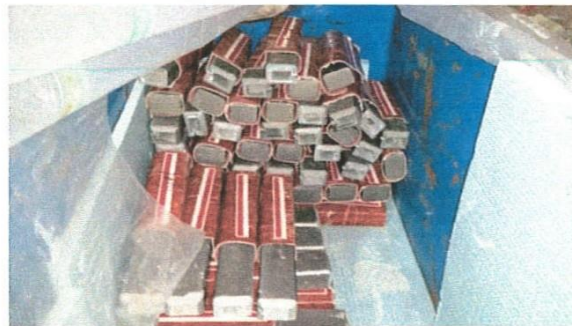
Asbestos products found at the Executive Building Site, Brisbane