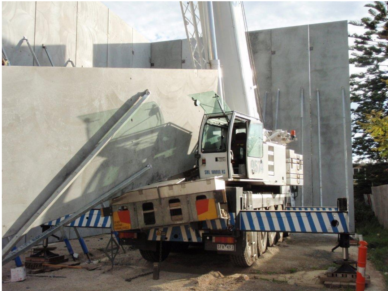
Panel collapse during installation, Brunswick Vic. August 2011

While the collapse in the above incident was due to the use of the wrong type of lifter during panel manufacture, this type of incident is likely to occur if the properties of the material used to make lifters deviates from the property requirements in AS3850.