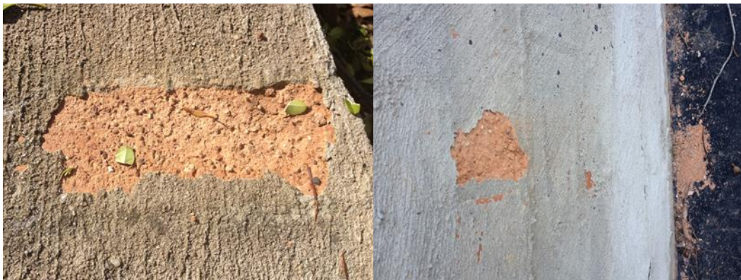
These bricks were not fit for purpose

We have evidence that suggests that General Purpose Bricks are being supplied on the Australian market which are under fired (i.e. they are not fired at the right temperature and/or for long enough) resulting in bricks that are soft / not durable and very susceptible to moisture. On questioning about the failure, it appears that the manufacturer has maintained that it is not their fault but the purchasers for not specifying and purchasing Exposure Grade Bricks.