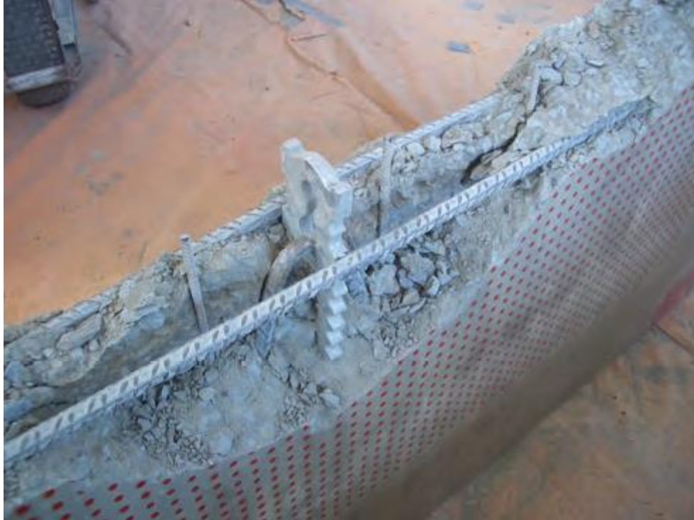
Cast in edge lifter tension test