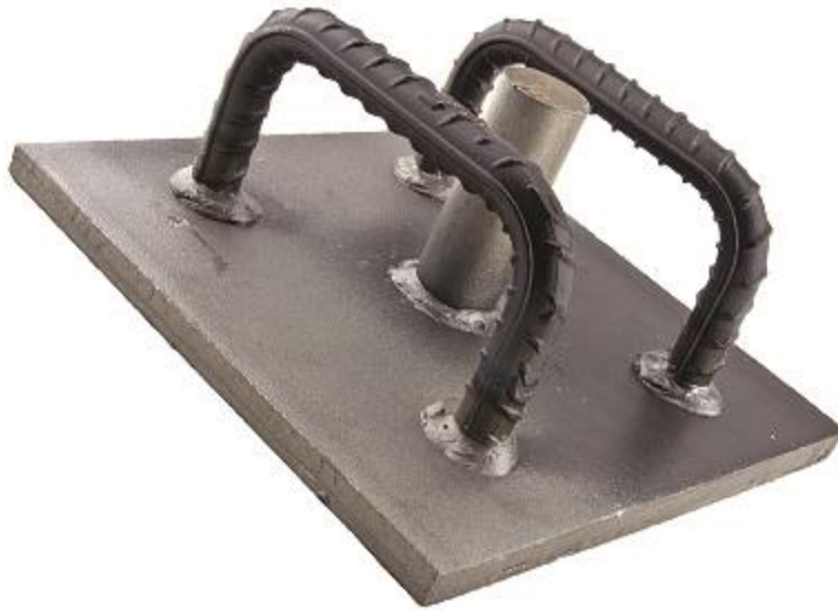
The back of a typical cast in plate