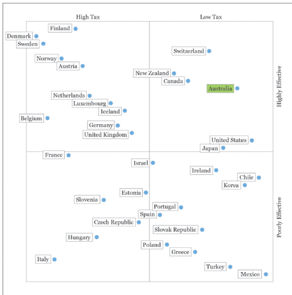
Figure 1 - OECD nations ranked by lowest taxing and highest effectiveness (2010) 16

In 2012, Australia was ranked in the 94 th percentile for government effectiveness and 97 th for regulatory quality by the World Bank. 17 Government effectiveness measures the quality of public services, its independence and the quality of policy formulation and implementation. Regulatory quality measures the ability of the government to formulate and implement sound policies and regulations that permit and promote private sector development. Ongoing cuts in the public sector through labour and funding reductions threatens this standing.