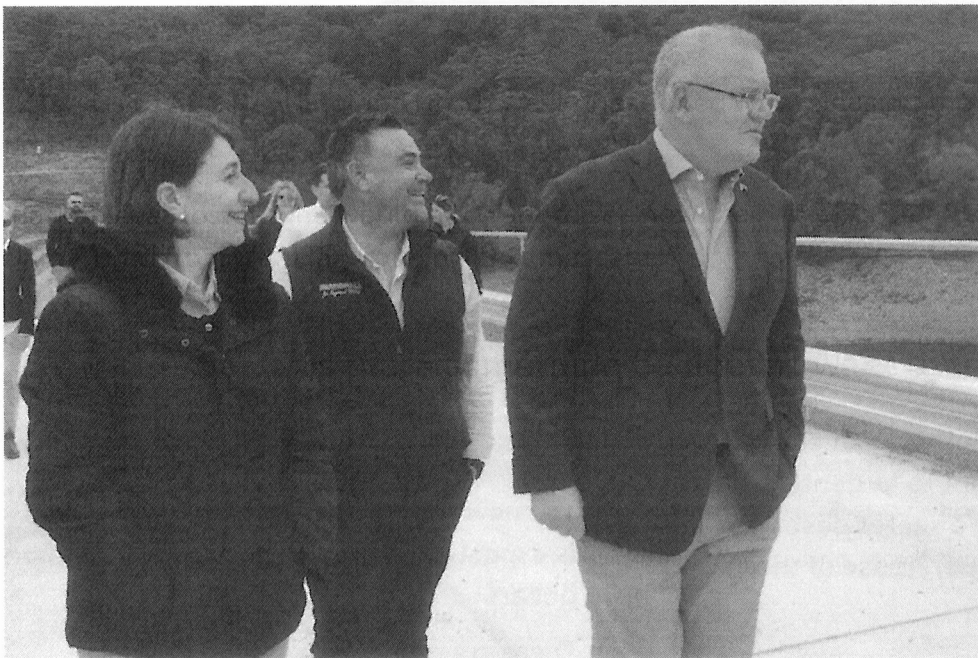
Then NSW Premier Gladys Berejiklian, Deputy Premier John Barilaro and Prime Minister Scott Morrison announced the new dam in late 2019.