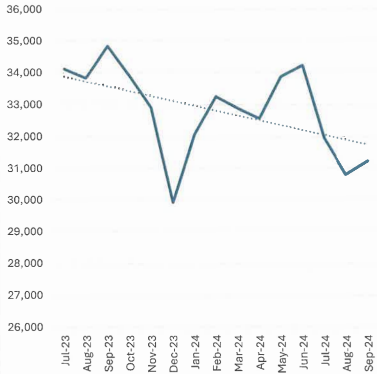
Total Number PALM Workers Engaged