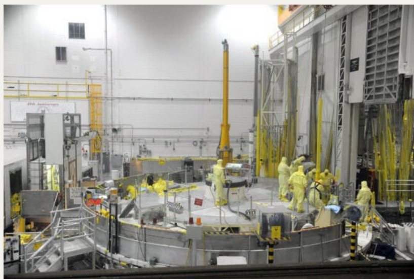
Technicians load an experiment at the Advanced Test Reactor on the Idaho National Laboratory site.

But a study published May 31 in Proceedings of the National Academy of