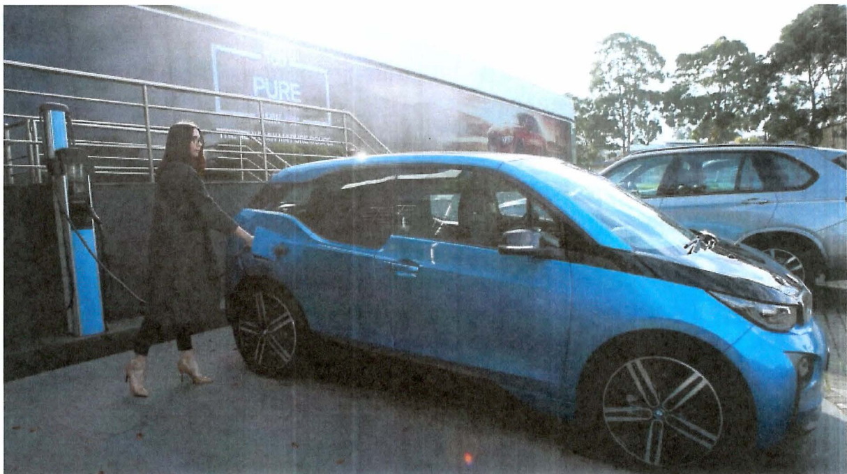
The charge point at BMW in Mulgrave for The BMW i3 electric car.

But it is the projections that are staggering. China is the largest vehicle market in the world with 25 million annual vehicle sales, with an expectation that electric vehicles will make up 10 per cent of new sales by 2025 and 30 per cent by 2030.