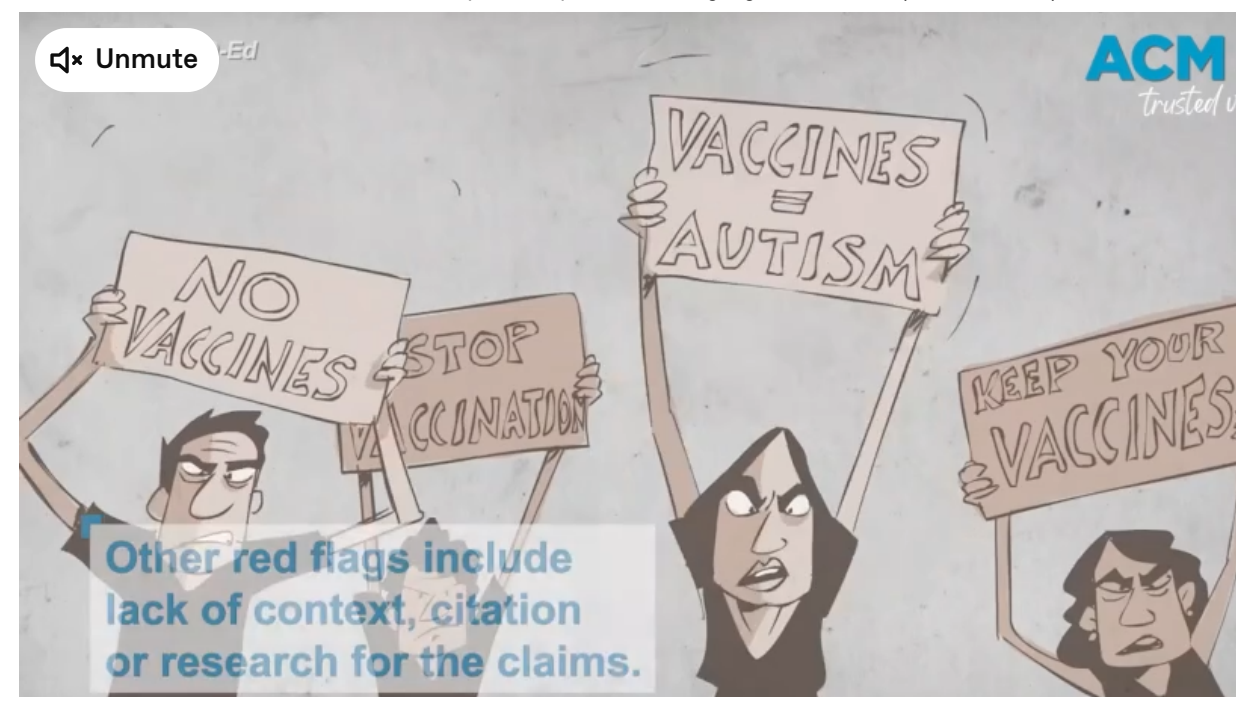
Authorities are cracking down on social media influencers after a rise in dubious food and health trends.

Federal and state funded urgent care clinics offer free GP medical care for patients with urgent but not life-threatening health concerns, with the aim to reduce pressure in emergency departments (ED).