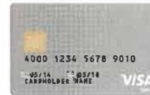
Cashless Debit Card (CDC)