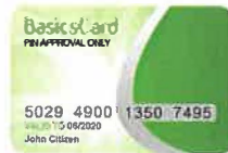
Income Management (BasicsCard)

Panya anangu tjuta BasicsCard kanyilpa Northern Territory-angka tjana mukuringkula panya mantjintjaku mani Cashless Debit Card kutu panya March 2021 nguru. Anangu mukaringkula BasicsCard panku nyinanyatjaku ka kutjuparinytja wiya. Ka nyuntumpa mani kutjuparinytja wiya ka nyuntu mukaringkula tjunkanytja CDC kutu.