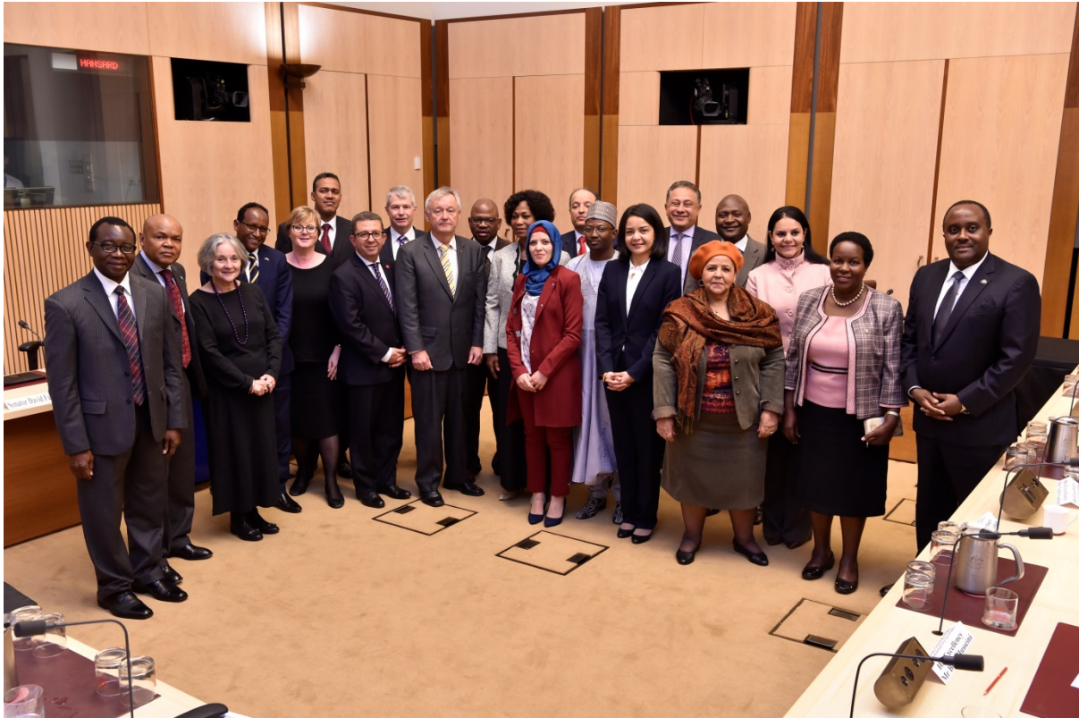
Members of the committee with the Heads of Mission of the Africa Group

1.5 The committee thanks the organisations and individuals who participated in the public hearings as well as those who made written submissions. The committee would like to extend its particular thanks to the Heads of Mission of the Africa Group for their joint submission and attendance at the committee's hearing in Canberra on 11 May 2018.