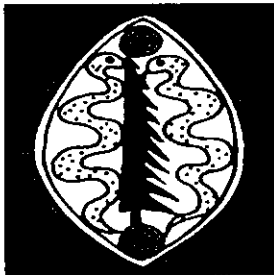
Aboriginal Legal Rights Movement Inc