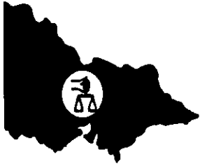
Victorian Aboriginal Legal Service Co-operative Ltd