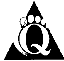
Aboriginal & Torres Strait Islander Legal Service (Qld) Ltd