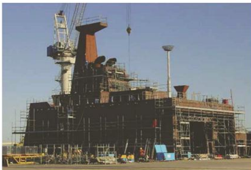
Figure B: Aft superstructure block under construction in Spain. Australian construction of this block required it to be constructed and lifted as four separate blocks due to manufacturing and lifting capacity restrictions. 65