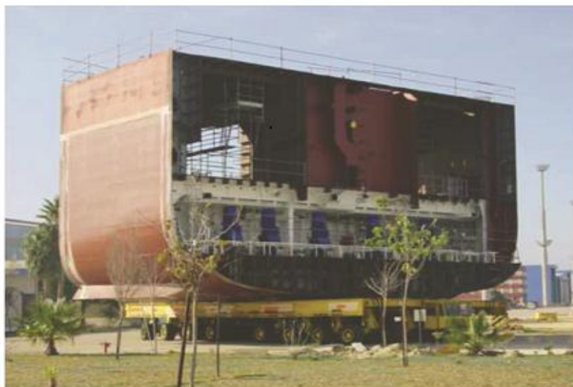
Figure A: Typical block under construction in Spain (462 tonnes) 64