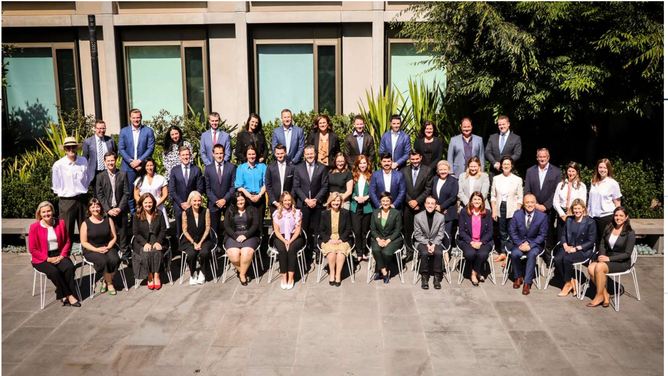
9 March 2023 | Elections: A change we can plan for | PPSN Conference, Canberra