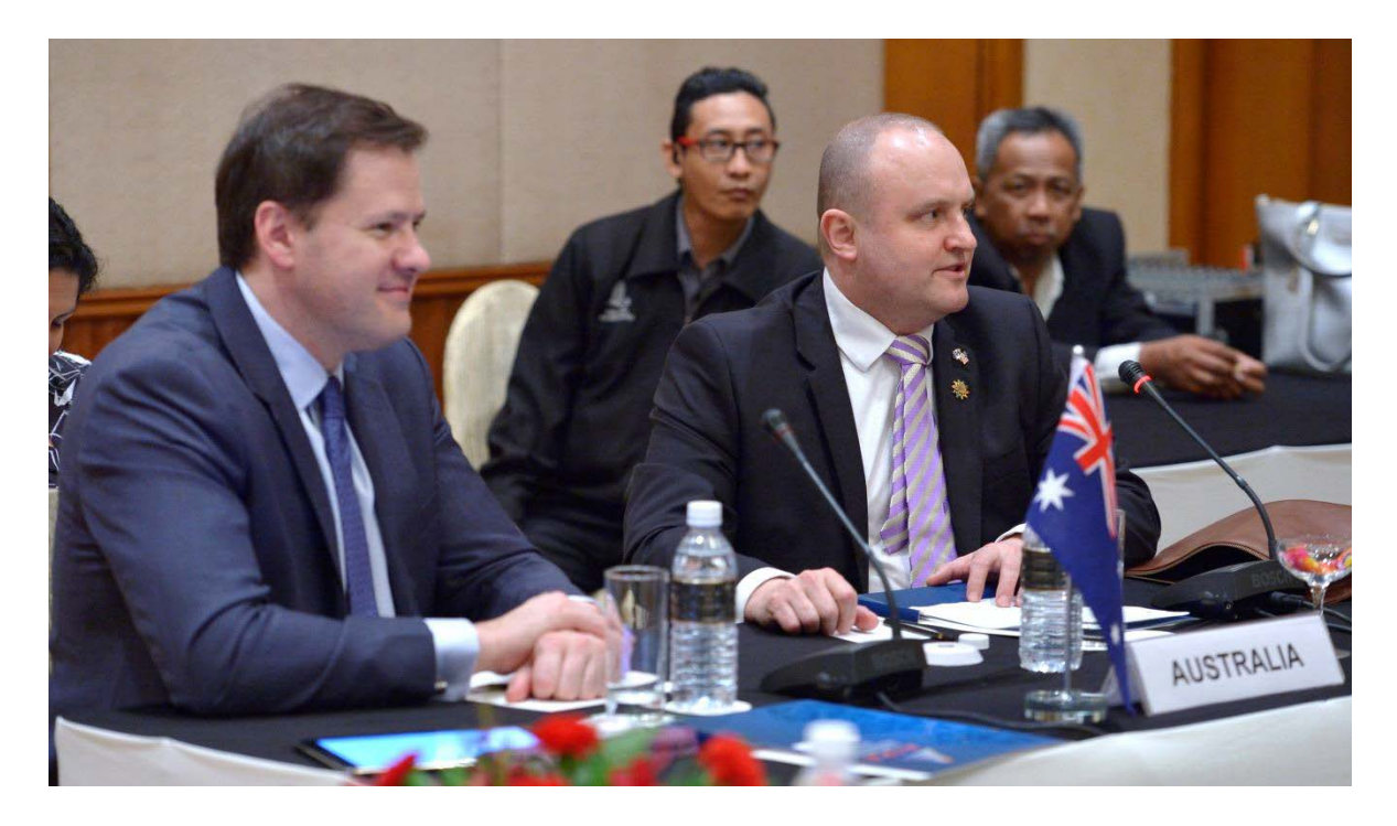
Figure 1.1 Delegates during the Dialogue Session