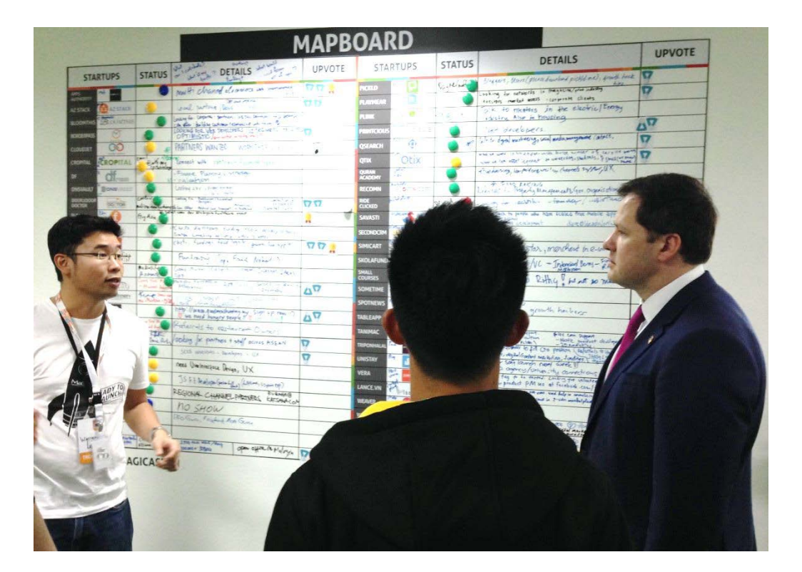
Figure 2.4 MaGIC representatives describing the Accelerator Program processes