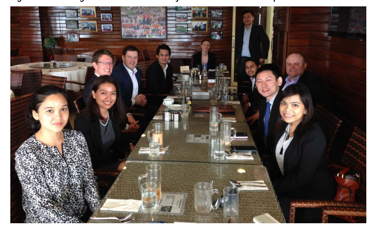
Figure 2.2 Meeting with members of the Malaysian Youth Parliament and political staffers