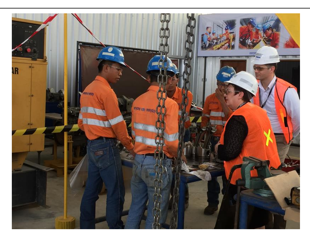
Corporate social responsibility (CSR) activities

Both Thiess and Coates Hire engage in a range of CSR programs.