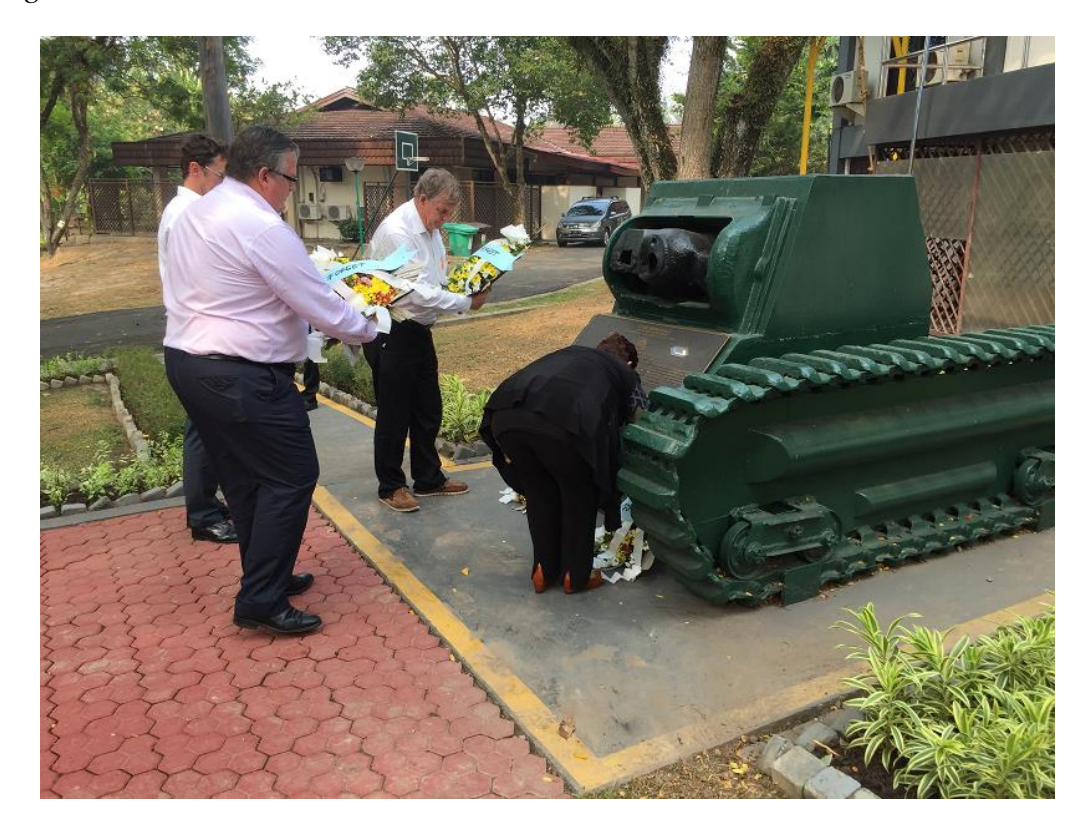
Laying wreathes at the Matilda Tank Memorial