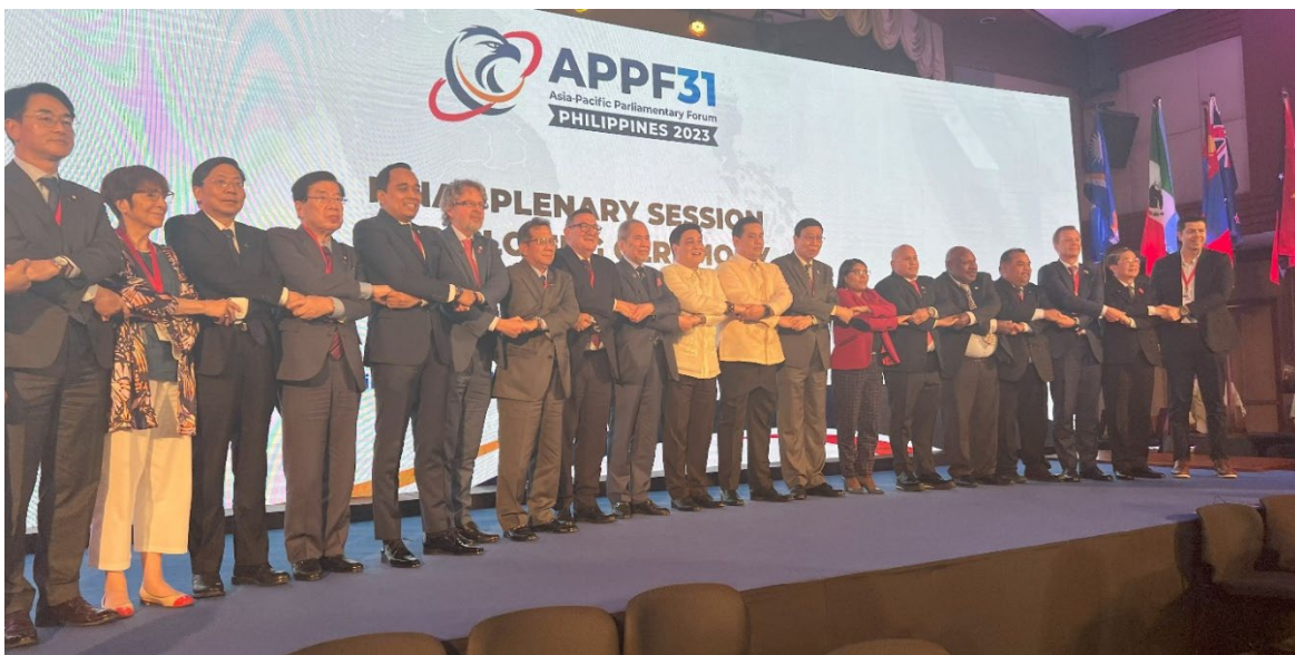
Delegation leaders at the closing ceremony