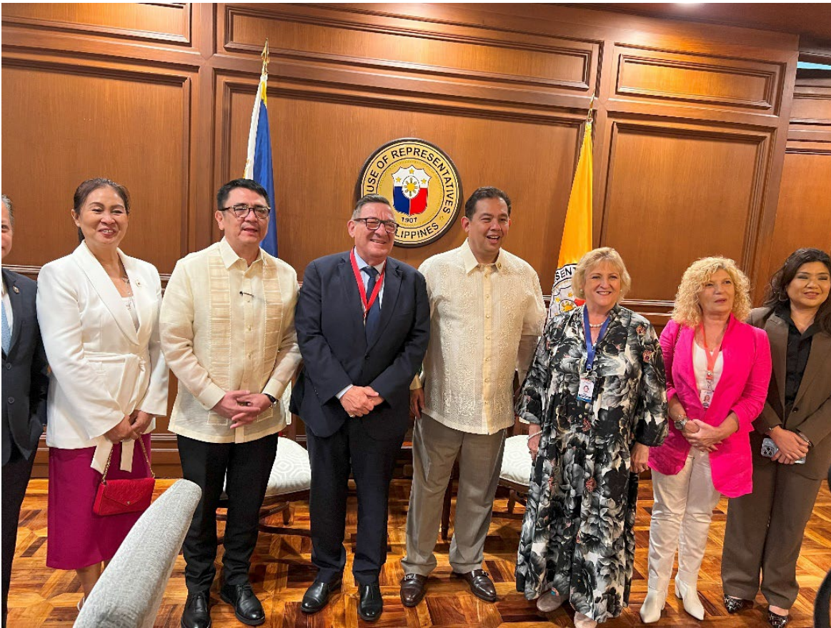
Mr Georganas MP and the Hon Michelle Landry MP meet the Speaker of the Philippines House of Representatives, the Hon Martin Romualdez, and other Members of Congress