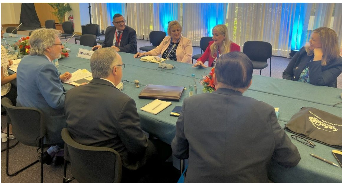
Discussions between the Australian and Canadian delegations to APPF-31

Australia's delegation additionally participated in bilateral meetings with like-minded delegations from other countries, including those of Japan, Canada and host nation the Philippines, to discuss issues of mutual concern and our respective approaches to the resolutions under consideration in the Working Group and Drafting Committee meetings.