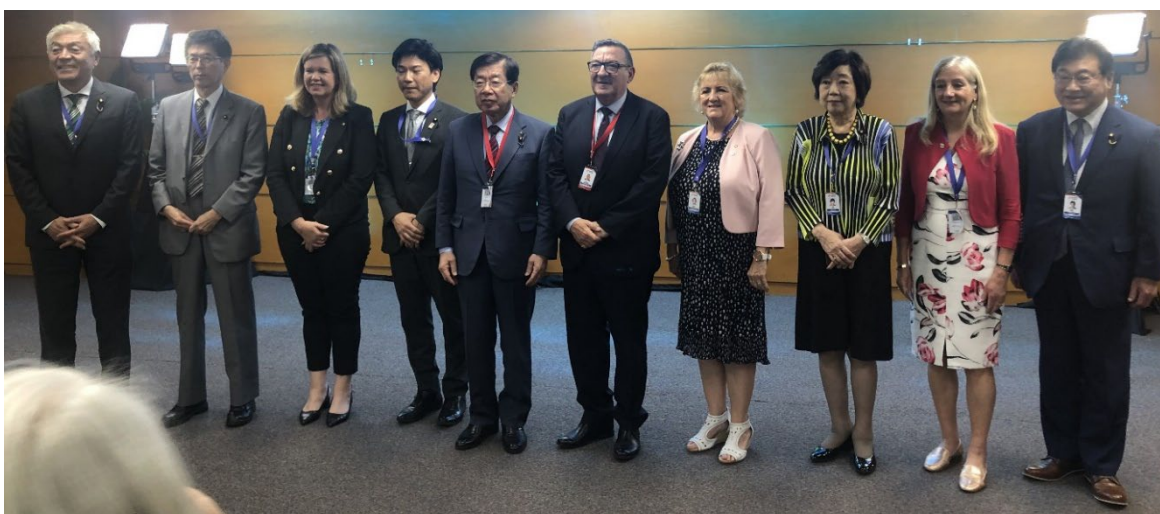
The Australian and Japanese delegations to APPF-31