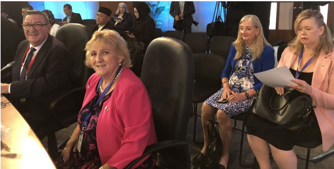
Australia's delegation during Plenary Session 1 on Political and Security Matters