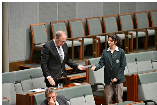
Time is reserved each sitting Monday for private members' business in the House and Federation Chamber.

Private members' business —Private members (that is, members who are not ministers or assistant ministers) may lodge notices to be moved and debated on sitting Mondays. Private members' notices (and orders of the day) may be moved and debated at the times allowed on Mondays under the standing orders, if selected by the Selection Committee for introduction (or further debate). (See also Infosheet No. 6 Opportunities for private members .)