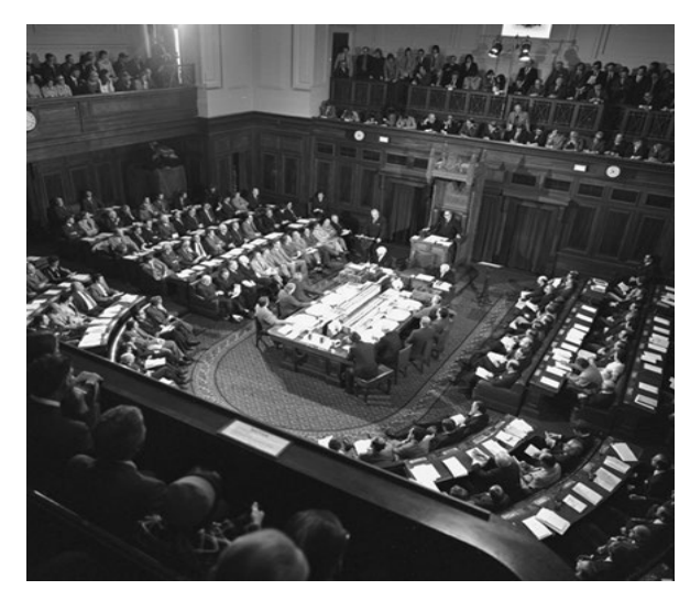
Joint sitting 1974

If the Houses disagree on the bill again after a double dissolution and elections for both Houses, the Governor-General may convene a joint sitting of the Senate and the House of Representatives to enable the members of both Houses to vote together to resolve the matter. Because the House of Representatives has approximately twice as many members as the Senate, a joint sitting is likely to give a majority in the House the opportunity to outweigh the resistance of a majority in the Senate.