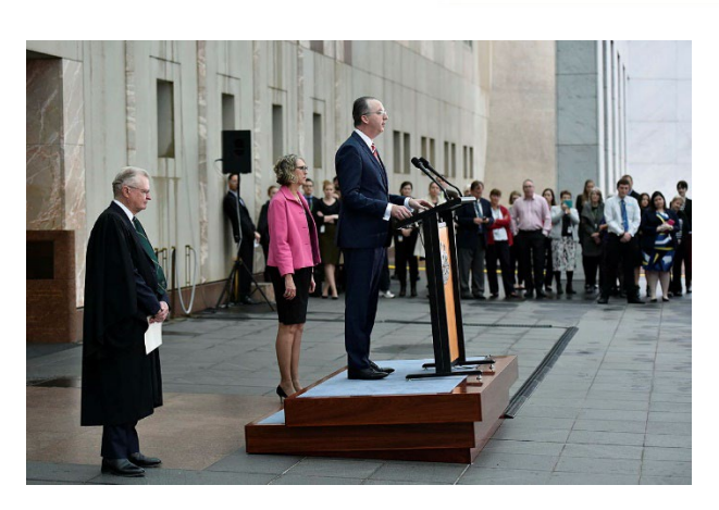
The Official Secretary of the Governor-General reading the proclamation to dissolve the House of Representatives and the Senate in May 2016

When the House expires, or is dissolved in normal circumstances, the Senate continues to exist. This is because Senators remain in office until the completion of their term and only half stand for election at any one time. The Senate can only be dissolved in accordance with the double dissolution provisions of the Constitution.