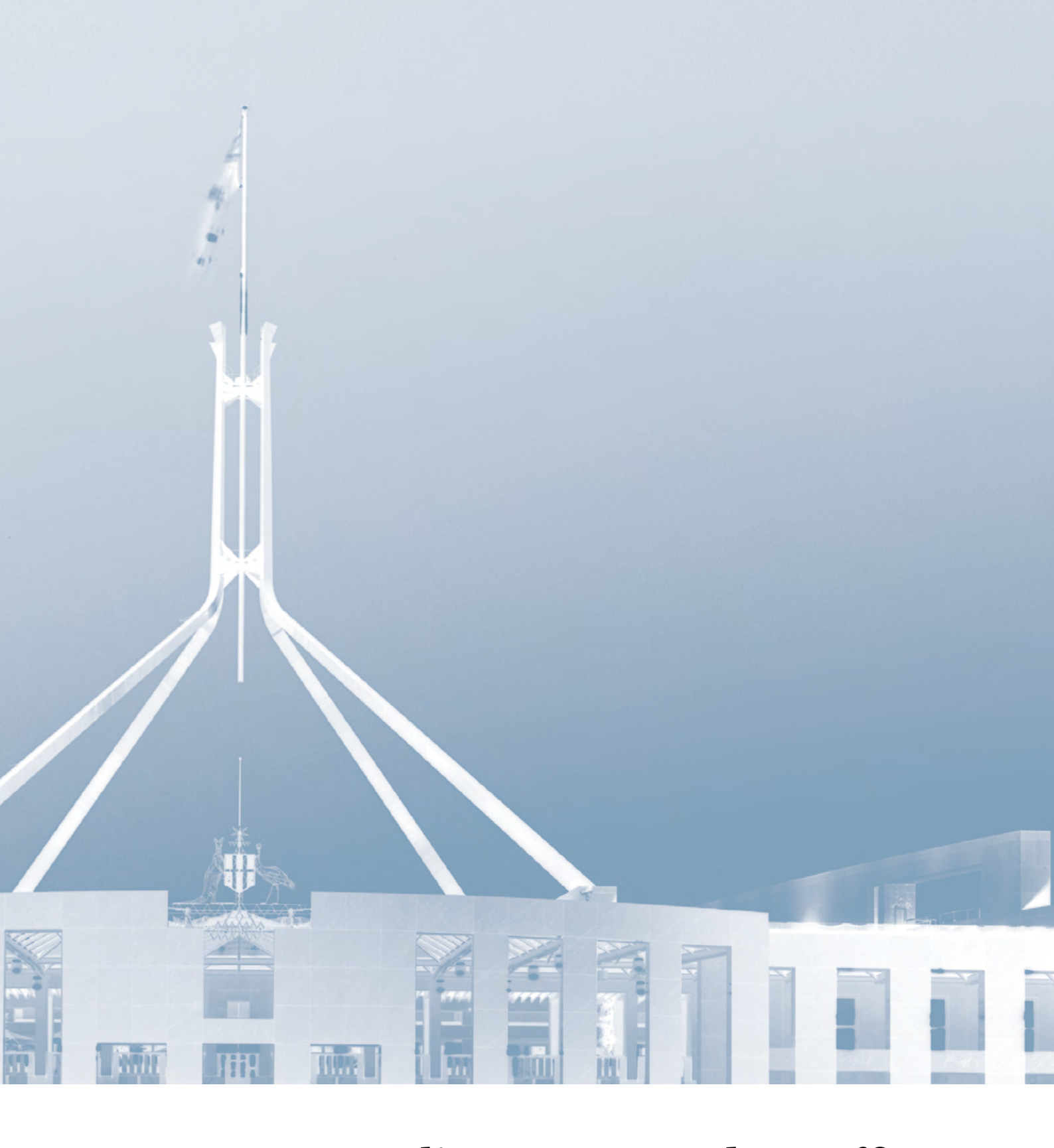
Parliamentary Budget Office annual report 2015–16