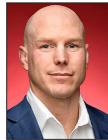
POCOCK, Senator David ACT