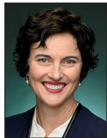
CHANEY, Kate MP Curtin