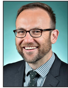
BANDT, Adam MP Melbourne