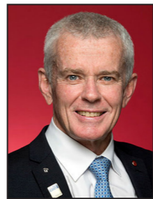
ROBERTS, Senator Malcolm QLD