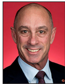
VAN, Senator David VIC