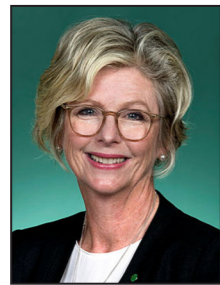
HAINES, Helen MP Indi