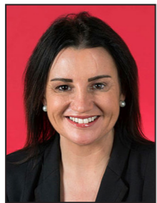
LAMBIE, Senator Jacqui TAS