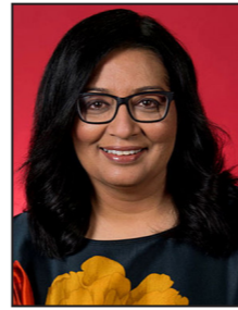
FARUQI, Senator Mehreen NSW