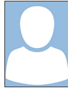
HODGINS-MAY Senator Steph VIC