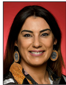
THORPE, Senator Lidia VIC