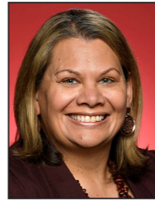
COX, Senator Dorinda WA