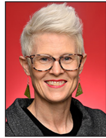
ALLMAN-PAYNE, Senator Penny QLD