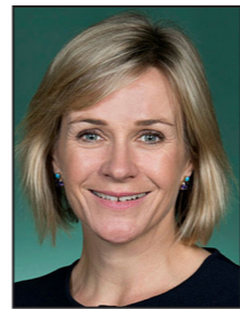
STEGGALL, Zali MP Warringah