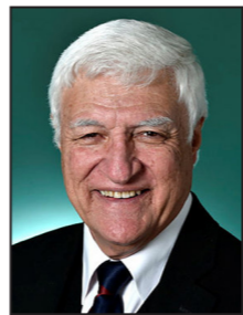
KATTER, The Hon. Bob MP Kennedy