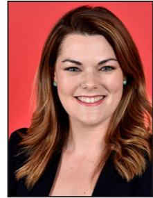
HANSON-YOUNG, Senator Sarah SA