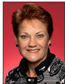
HANSON, Senator Pauline QLD