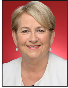
POCOCK, Senator Barbara SA