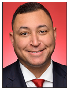
BABET, Senator Ralph VIC

This product will be updated as official photos are published.