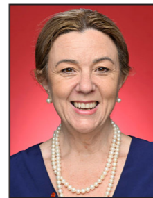
TYRRELL, Senator Tammy TAS