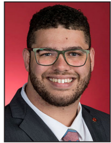
STEELE-JOHN, Senator Jordon WA