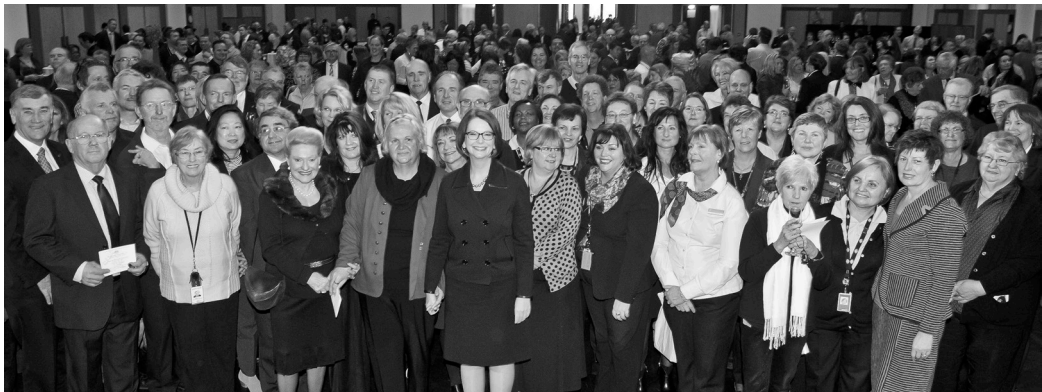
Prime Minister Julia Gillard (centre) with the Presiding Officers and attendees of the 25 th Anniversary morning tea, held in the Great Hall, Parliament House, on 24 June 2013.

Later in June, the celebrations continued when past and present Parliament House staff were acknowledged at an anniversary morning tea held in the Great Hall. About 700 current and former staff attended the morning tea along with the Prime Minister the Hon. Julia Gillard MP, the President of the Senate, Senator the Hon. John Hogg, the Speaker of the House of Representatives, Ms Anna Burke MP, and the Leader of the Opposition, the Hon. Tony Abbott MP.