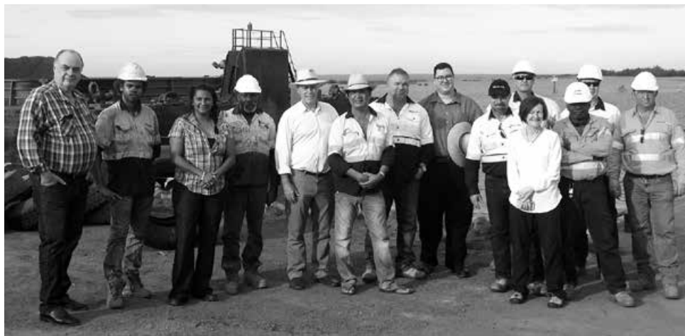
Members of the Joint Select Committee on Northern Australia inspecting a mining site in Borroloola, Northern Territory.

For its inquiry into the role of the technical and further education (TAFE) system and its operation, the Standing Committee on Education and Employment also created an anonymous online survey to encourage participation in the inquiry by those who have experienced TAFE firsthand or are considering TAFE as an option. At 4 June 2014 the committee had received more than 3,600 responses. In June 2014 the committee published a snapshot of the survey online, which included key statistics from the survey and a selection of responses received. The Committee Office has found that using online questionnaires for inquiries that are likely to attract wide community interest is a time- and cost-effective way to obtain community opinion on an issue. This complements the evidence-gathering methods of written submissions and oral evidence.