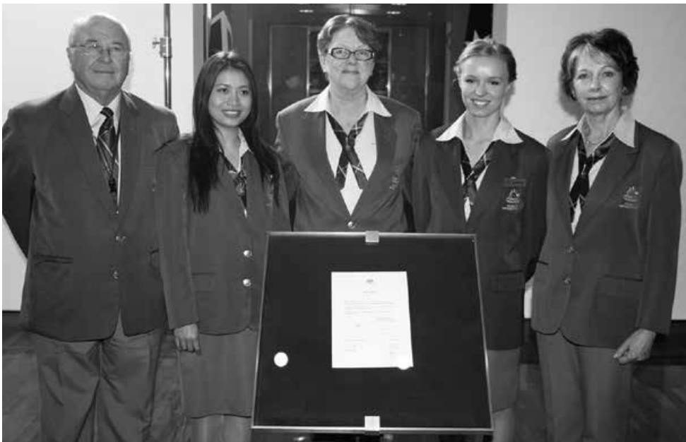
Parliamentary attendants with the Governor-General's proclamation dissolving the House of Representatives for the Forty-third Parliament, August 2013.

The department is responsible for the custody and preservation of, and the provision of access to, the official records of the House, including Acts, bills, the Votes and Proceedings and all documents presented to the House dating from 1901. The records are stored in an archive in the basement at Parliament House. We continue to monitor the suitability of the archive environment.