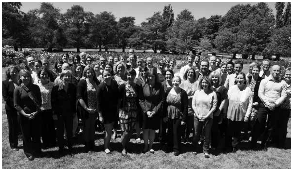
Committee Office staff attending a development seminar, October 2013.

During the year, the department completed its project to make available online digital copies of all House and joint committee reports tabled since 1901. A total of 417 House and 1,528 joint committee reports have been made available electronically through this project.