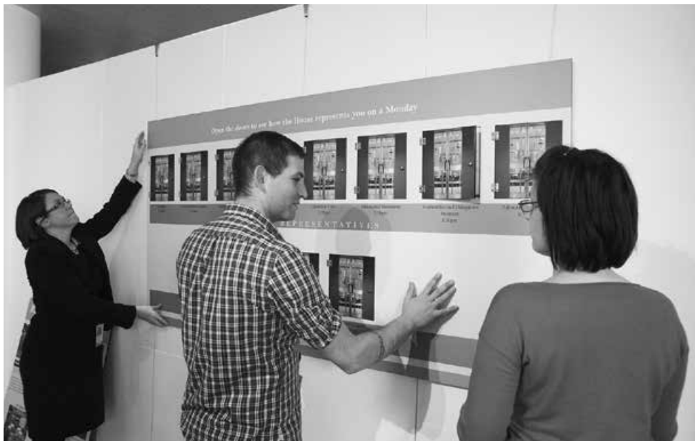
Staff of the International and Community Relations Office setting up for the Parliament House Open Day, August 2013.