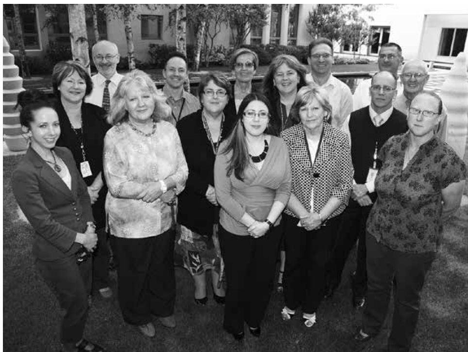
Staff of the House of Representatives Table Office.

It is expected that 2014–15 will bring a return to the long-term pattern of Chamber and Federation Chamber support activity. The focus will continue to be on providing high-quality services to meet the needs of members and other clients. The department's budgetary situation will remain tight, but within those constraints the department will continue to ensure that staff are well trained and equipped to deal with challenges that might arise.