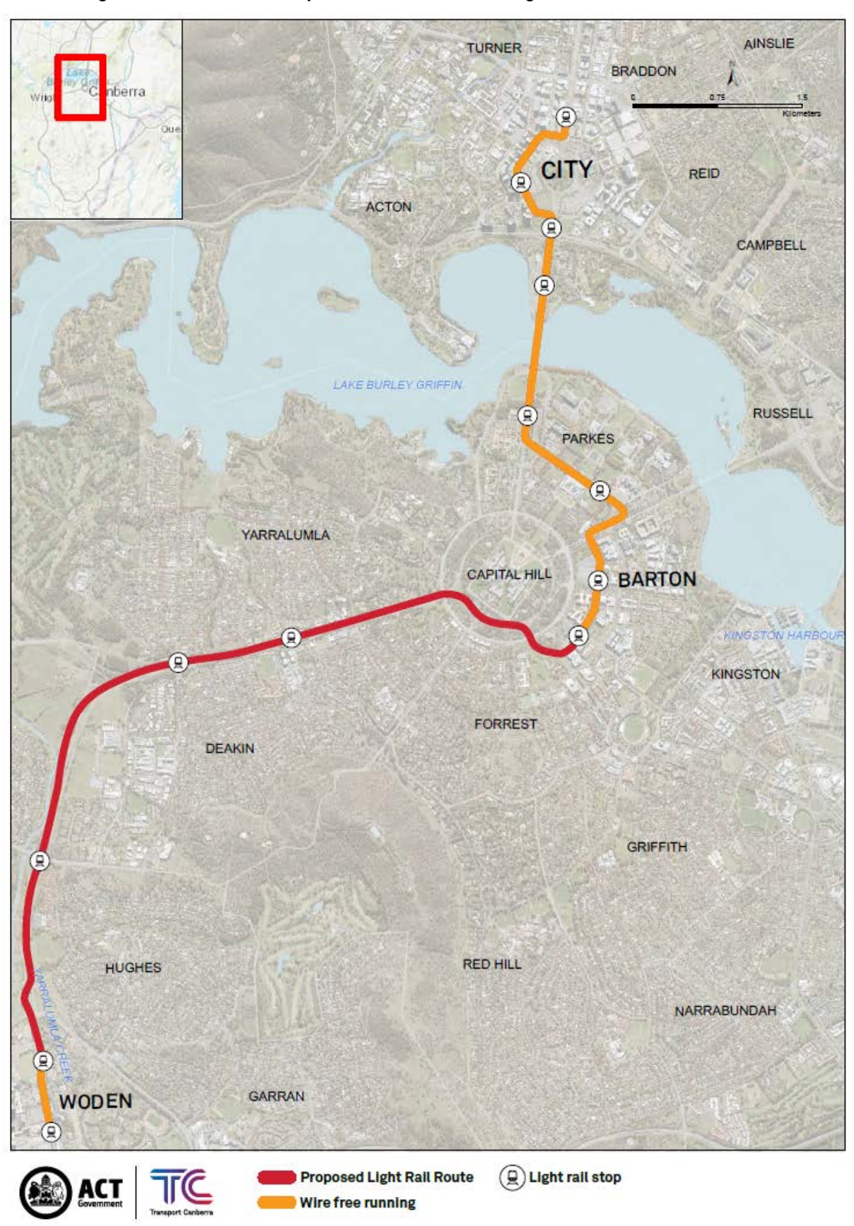
Figure 4.2 Overhead line power and wire-free running locations