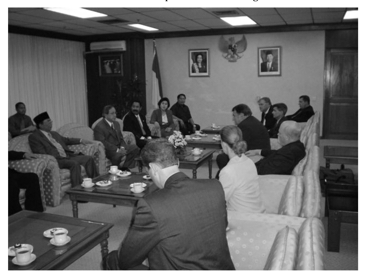
Figure 2.2 Call on HE Akbar Tandjung, Speaker of the DPR and Chairman of Golkar

2.7 After months of immersion in a vast amount of written and oral evidence about the bilateral relationship, the visit enabled the Committee to test out some of the conclusions it was in the process of forming. Discussions on many of the issues and developments within Indonesia also enabled the Committee to confirm or deepen its understanding on these matters.