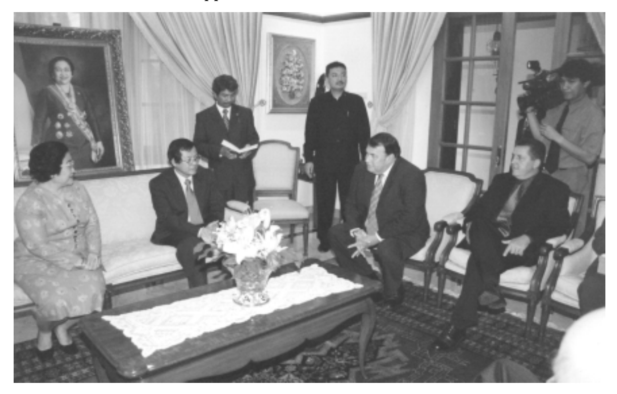
Figure 2.1 Courtesy call on HE President Megawati Soekarnoputri

2.6 The meetings served many purposes beyond the important extension of courtesies and the acknowledgement of the high level of cooperation that exists in a number of areas and of the need to maintain and extend this cooperation. Discussions were wide ranging and often robust and covered