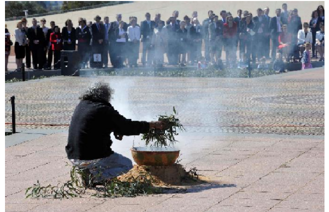
The indigenous ceremony of welcome at the opening of the 43 rd Parliament.

Commons Chamber during proceedings and this tradition has continued in the Commonwealth Parliament.