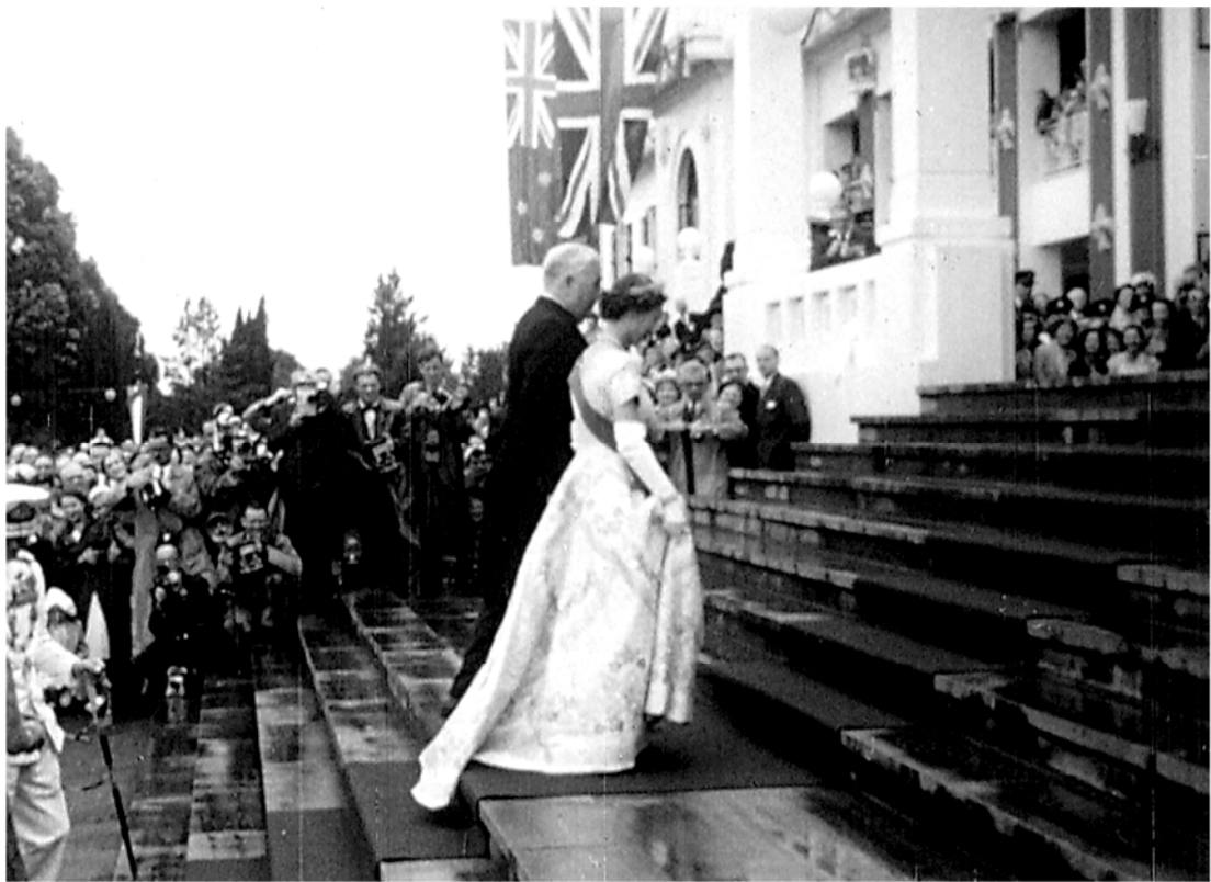
Image 4: The Australian national flag took precedence over the Union Jack for the first time on the Provisional Parliament House in February 1954