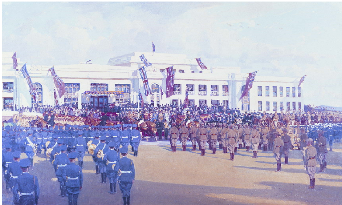
Image 10: Harold Septimus Power, 'The Arrival of Their Royal Highnesses the Duke and Duchess of York at the Opening of Federal Parliament House Building, Canberra, 9 May 1927' (1928)

It was not surprising, then, that British flags took precedence over Australian ones on Parliament House, Canberra at its opening by the Duke of York in May 1927. What was surprising were the red rather than blue ensigns decorating the building, if we are to believe the commissioned painting of the event. (see Image 10, below) Surely the Commonwealth's most important public building would be decked out in blue ensigns—the Commonwealth government's flag. The artist, Septimus Power, known for his ability to 'create a feeling of movement and drama', may have painted the ensigns red for dramatic effect—to highlight the St George crosses in the Union Jacks, and the carpet leading from the Duke's carriage to the main entrance. Or was it to underline the red ensign as the Australian flag people could use?