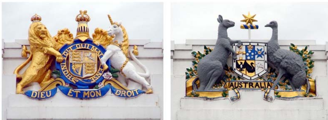
Image 2: British arms (left) and Australian arms (right), front entrance, Old Parliament House

The bold central display at Parliament House provides a sharp contrast to the two sets of flags and arms—British and Australian—on Australia’s provisional parliament house completed in 1927, now known as Old Parliament House. The Union Jack and Australian blue ensign flew above the roof of that building, not every day but on special flag days. That dual display of flags has now gone. But the coats of arms, now painted (but not accurately) can still be seen above the rounded feature windows either side of the front entrance: the British arms on the left with English, Scottish and Irish symbols; and the Australian arms on the right with the symbols of the six federating states (image 2). The door knobs at the front entrance also display the British and Australian arms.