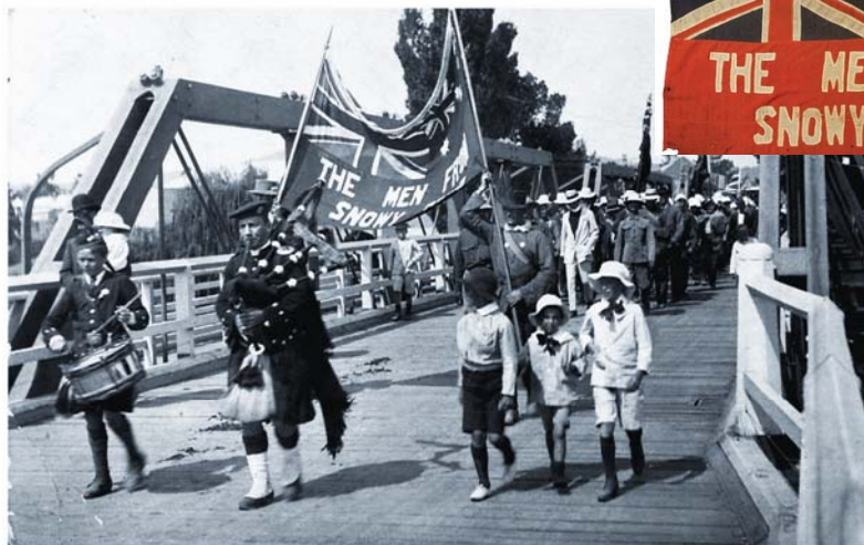
Image 8: The Australian red ensign, seen here in a recruiting banner at Queanbeyan in 1916, was more common than the blue one

From Gilgandra in New South Wales a group of recruits, the 'Cooees' marched to Sydney late in 1915 carrying the Australian red ensign and the Union Jack. From Delegate in the south, the men from Snowy River carried an Australian red ensign, stitched by their women onto a larger British red ensign, in a recruiting march to a depot in Goulburn in January 1916.