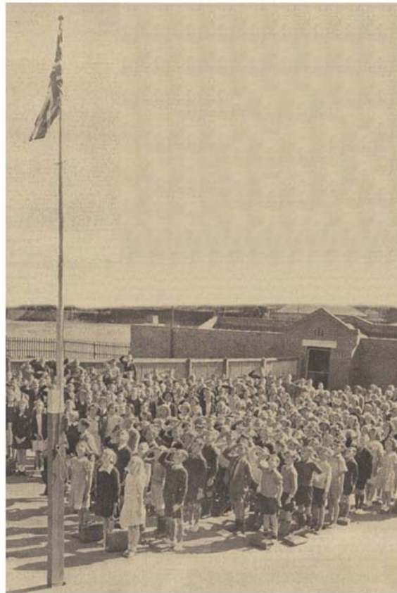
Image 11: Children of Brighton-rd State School, Melbourne, salute the Union Jack in 1938

Albert Dunstan, the Victorian Country Party premier who in 1940 allowed state schools to buy blue ensigns from flag suppliers, was unusual in his grasp of the issue and his determination to solve it. For patriotic purposes, he argued, the blue, not the red, ensign should be used by governments and people. But Menzies, more cautious despite receiving advice which confirmed Dunstan's opinion, chose instead to announce in 1941 the end of restrictions on the flag's use. He feared that declaring the blue ensign to be the national flag would raise awkward questions about the Union Jack in the midst of war.