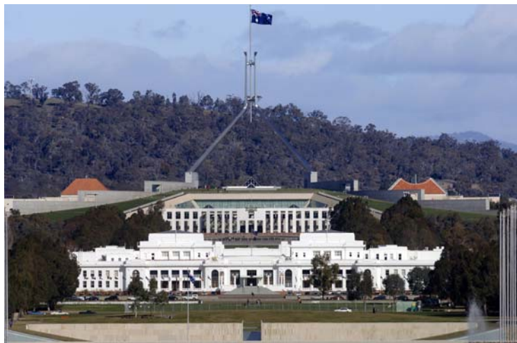
Image 1: Parliament House, Canberra, showing the Australian Coat of Arms and flag

The Australian national flag has become the most familiar of our national symbols. Less familiar is the Commonwealth Coat of Arms. Parliament House in Canberra, completed in 1988, displays both the flag high above the building, day and night, and the coat of arms above its front entrance.