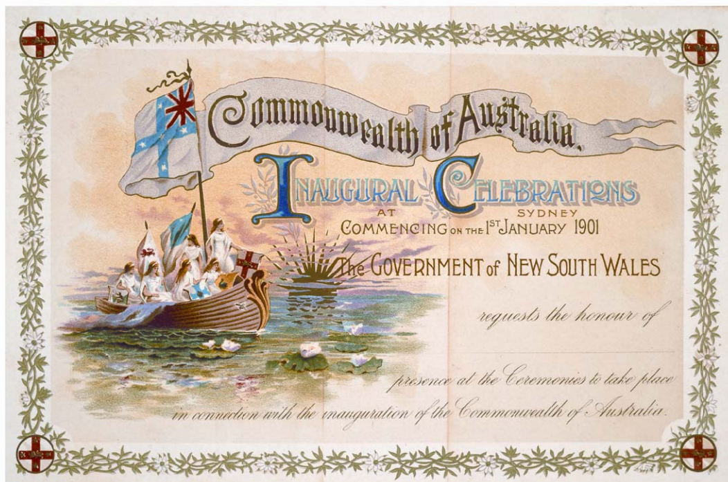
Image 5: Invitation to the Inauguration of the Australian Commonwealth, 1901, showing the federation flag

At its inauguration in January 1901, the Australian Commonwealth did not have an Australian national flag, though many Australians thought that the federation flag would become one. This popular flag, a British white ensign with a blue cross bearing white stars, was once used as an unofficial shipping flag along the east Australian coast from the early 1830s. During the 1898 federation campaign the Australasian Federation League of New South Wales promoted it as the flag for the new Commonwealth with the motto ‘One people, one destiny, one flag’. In 1901 it featured on invitation cards for the celebrations of January and May.