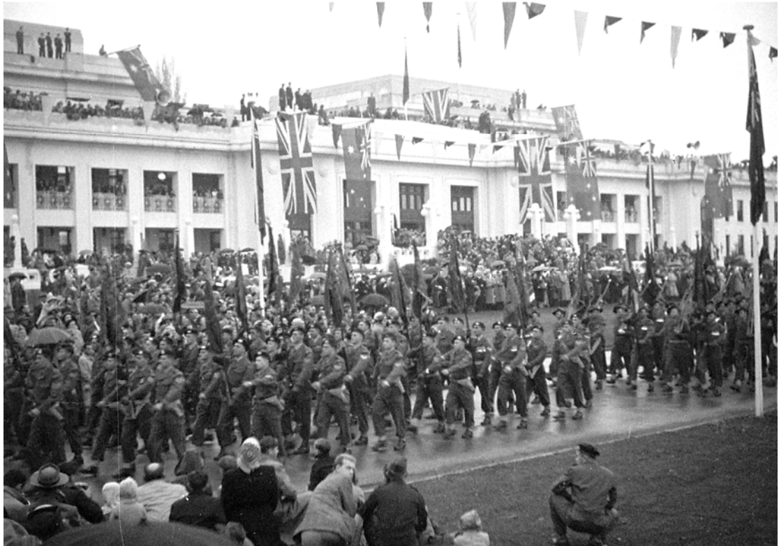
Image 3: Jubilee celebrations of federation in June 1951, showing the Union Jack taking precedence over the Australian blue ensign on provisional Parliament House