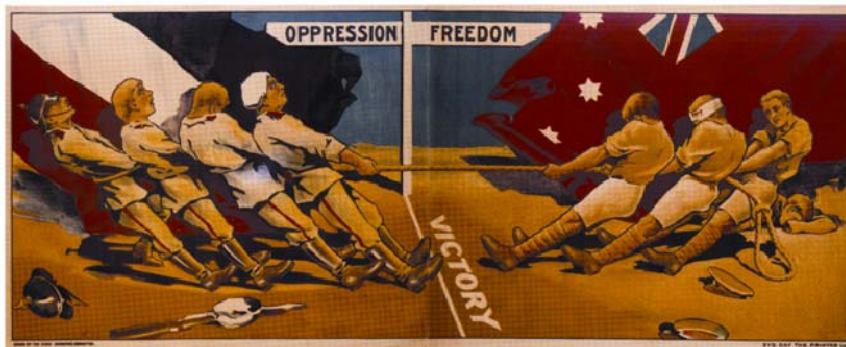
Image 7: The Union Jack as the national flag, and the red and blue Australian ensigns were used on recruiting posters during World War I

From Gilgandra in New South Wales a group of recruits, the 'Cooees' marched to Sydney late in 1915 carrying the Australian red ensign and the Union Jack. From Delegate in the south, the men from Snowy River carried an Australian red ensign, stitched by their women onto a larger British red ensign, in a recruiting march to a depot in Goulburn in January 1916.