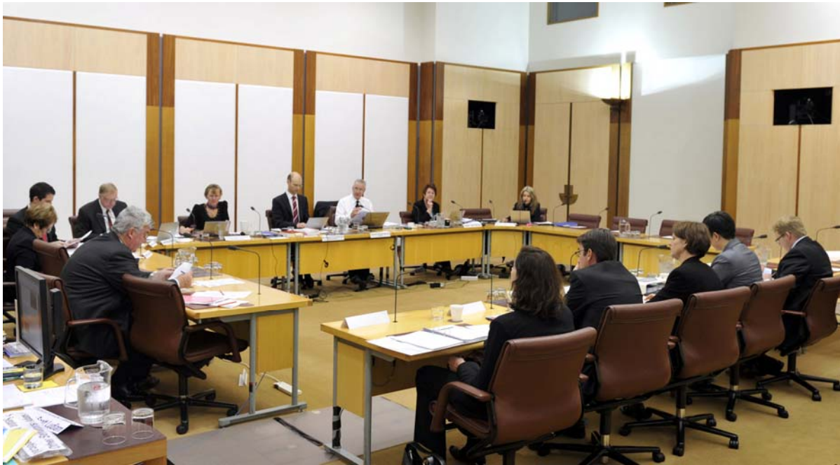
Environment and Communications Legislation Committee during estimates hearings in 2011

explanations from ministers in the Senate, or officers, relating to the items of proposed expenditure'. The majority of questions which committee members ask are answered by officers of the department or agency proposing the items of expenditure under consideration. It is usual, however, for a minister to attend public hearings of the committee to respond to questions about policy matters, which public servants are not required to comment upon. An observer from the Department of Finance and Deregulation also attends each hearing but is not usually called on to give evidence. Committees may seek advice or briefings from the office of the Auditor-General.