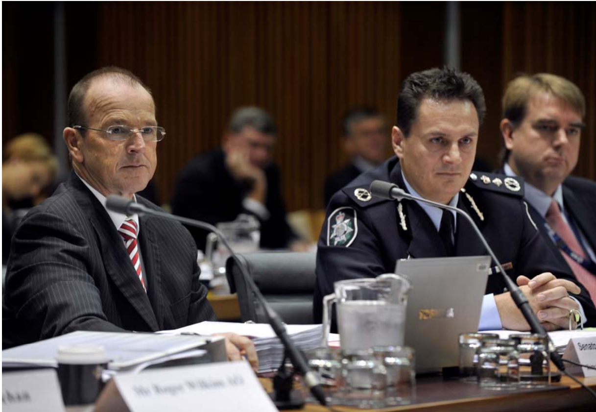
Tony Negus, Australian Federal Police Commissioner, and Senator the Hon. Joe Ludwig appear before the Legal and Constitutional Affairs Legislation Committee in 2011

technical background to proposed items of expenditure but are not expected to comment on policy—the advocacy and defence of government policies is properly the role of ministers. Public servants are expected to be politically neutral and while they may describe policies and explain their administration they are not required to express an opinion on them. For a fuller description of the rights and responsibilities of witnesses during Senate estimates and other committee hearings see Senate Brief No. 13.