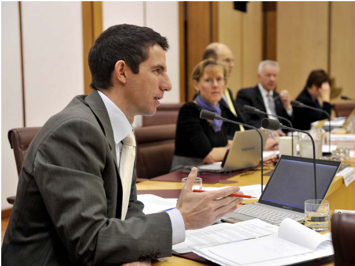
Environment and Communications Legislation Committee member, Senator Simon Birmingham during the Budget estimates hearings in 2011

Senators' dissection of the financial and performance information provided during the Senate estimates process can therefore be a catalyst to improved management and administration practice in the public sector; it is always a reminder to government of its obligation to be more accountable to Parliament, and to the Australian people, for its policy decisions. The Senate estimates process is thus a tool highly valued by senators, especially non-government senators, and has even been described as the 'best accountability mechanism of any Australian parliament' by the Hon. Senator John Faulkner.