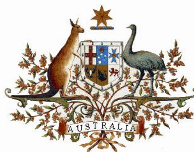
The Australian Coat of Arms

A Constitutional Convention was held in February 1998 to consider whether or not Australia should become a republic. After a majority of delegates voted in favour of a republic, constitution alteration bills were passed by the Parliament containing changes to the Constitution necessary to put into place the republican model most widely supported at the Convention. However, these proposals were unsuccessful at referendums held in November 1999.