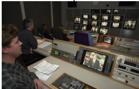
Proceedings of the House are broadcast on radio, television and the Internet

The Notice Paper shows all of the business awaiting the House's attention as well as some other information. It is