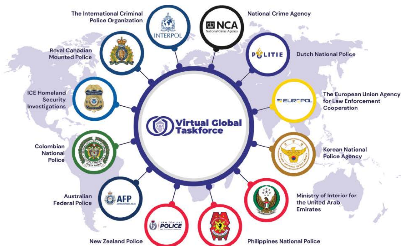
Figure 3: Membership of Virtual Global Task Force.

Ten national police forces together with EUROPOL and INTERPOL have joined together to form the Virtual Global Taskforce . 523 The international alliance is dedicated to the protection of children from online sexual abuse and other transnational child sex offences and shares intelligence assessments with members to target transnational offenders. Its strategic goals include supporting the private sector to improve their protective security by sharing intelligence on the threat to children from online sexual exploitation and abuse. Overall, it aims to make the internet a safer place, identify, locate and help children at risk, and hold perpetrators appropriately to account.