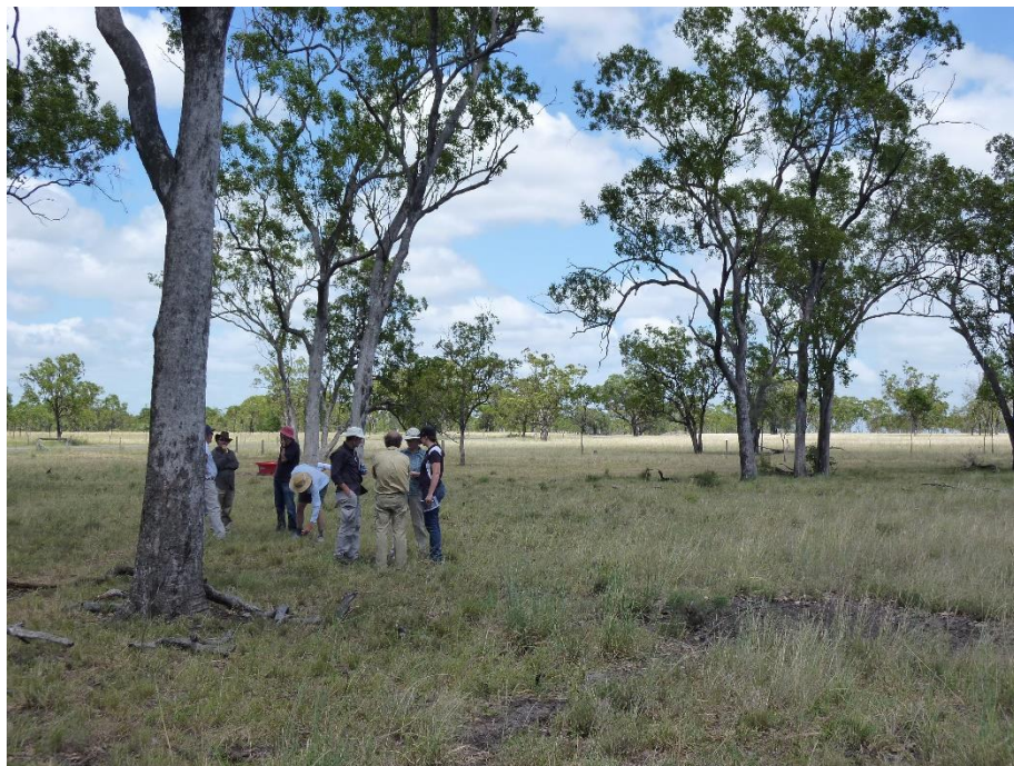
Australian Government officials assessing extensively cleared Poplar Box grassy woodland threatened ecological community near Toowoomba, Queensland, 2015.