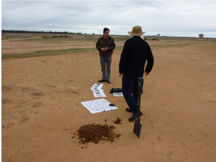
Planning hard pan soil conservation ripping for revegetation of saltbush, near Nyngan central New South Wales 2017.