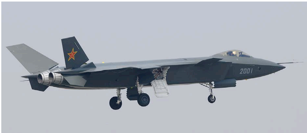
Prototype of the Chinese Chengdu J-20 supercruising high agility stealth fighter. The aircraft is now entering production, and was developed to compete with the US F-22A Raptor.

Chengdu J-20 0000 Ohms/sq. @ 08.00GHz IncPol:TM Pol:Theta Elev=045.0 Azm=225.0