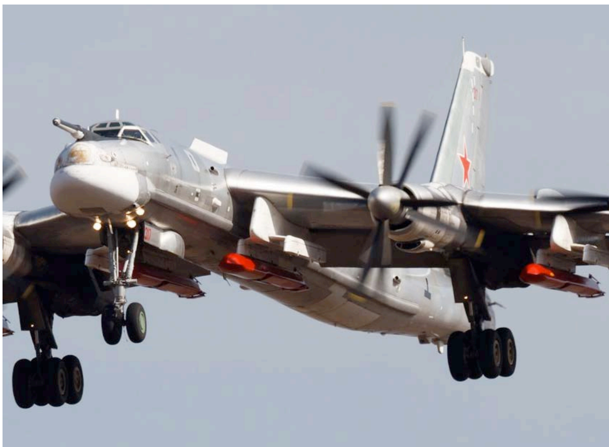
Russian Raduga Kh-101 low observable long range cruise missile during trials, carried by a Tu-95MS BEAR H. This stealthy cruise missile has been used repeatedly to attack targets in Syria.