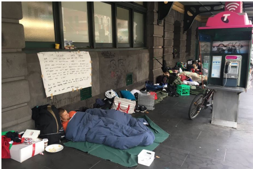
The number of people sleeping rough in Melbourne is up 70% since 2014

Based on the Australian Bureau of Statistics 2016 Census figures there are some 13,968 in Australia sleeping rough each night costing $357.8 million each year based on the SGS study.