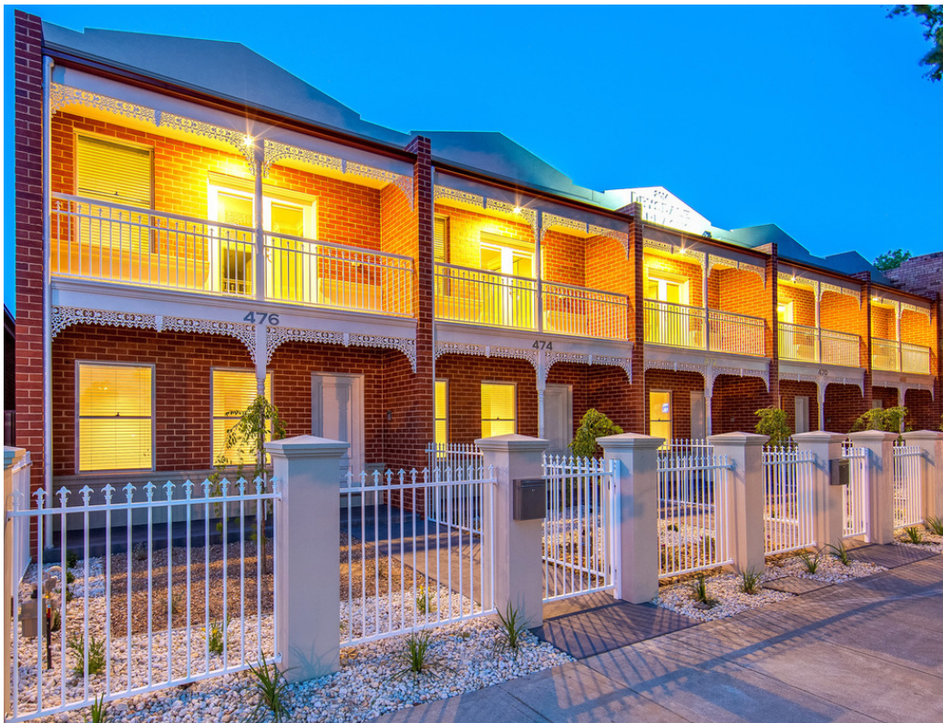
Private self-contained living units to be operated by Not for Profit Homeless Service Providers

The Federal Government should consider increasing the taxation concession for donations to ACNC registered and ATO endorsed Not for Profit homeless organisations, who will build homeless accommodation, from the current levels of 30% for companies and the 45% for individuals to become 100% for both categories for a period of 5 years after which the concession progressively reduce back to the existing taxation levels.